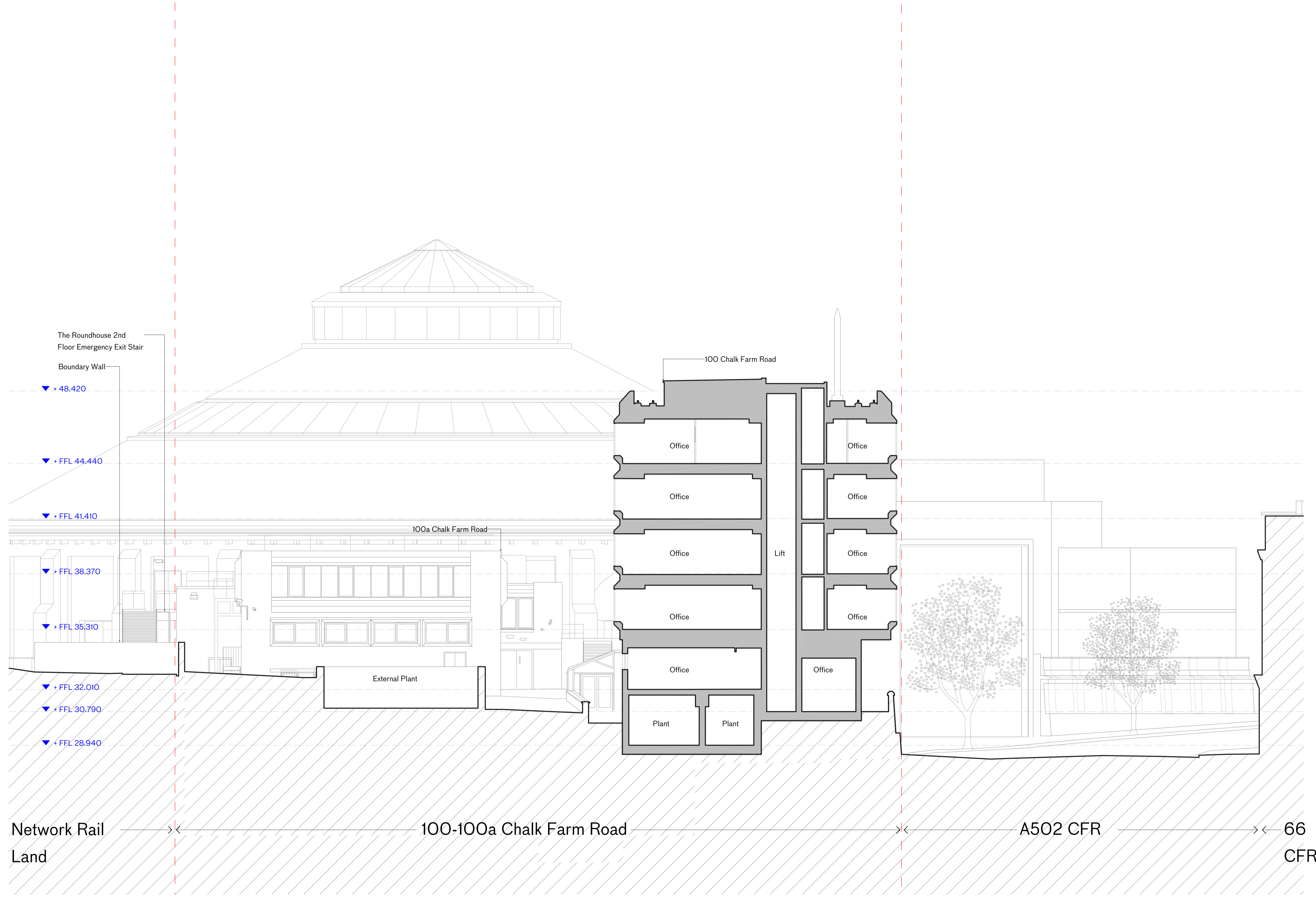
Existing Section AA

Drawing Key CFT - Chalk Farm Road PFS - Petrol Filling Station Site JC - Juniper Crescent