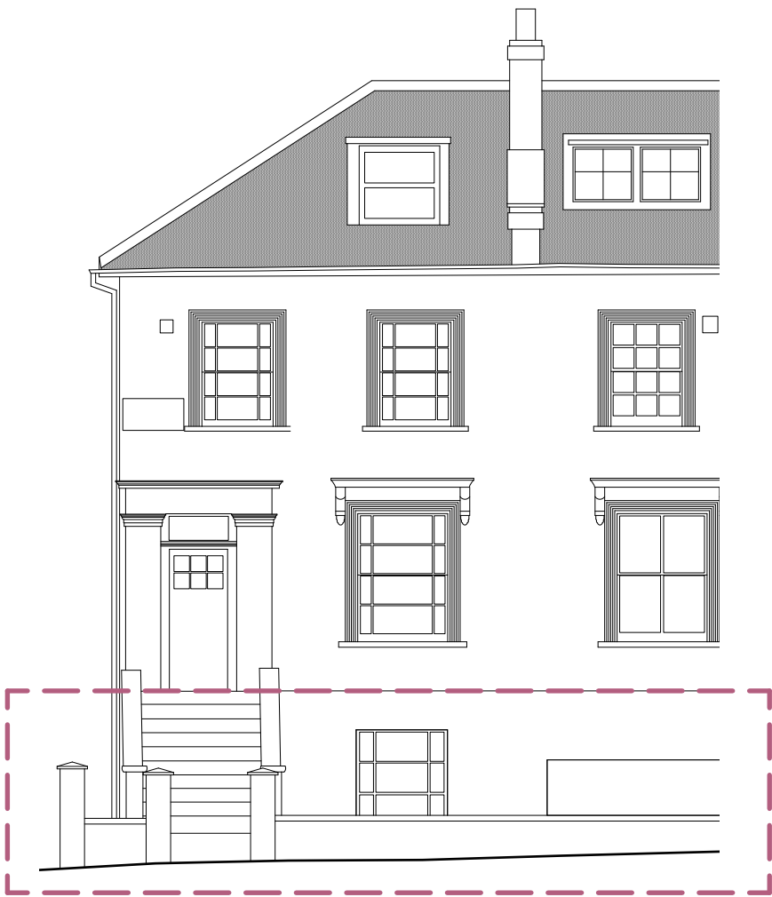
FRONT ELEVATION to Stratford Villas1:100