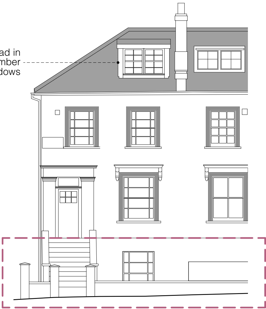
FRONT ELEVATION to Stratford Villas1:100