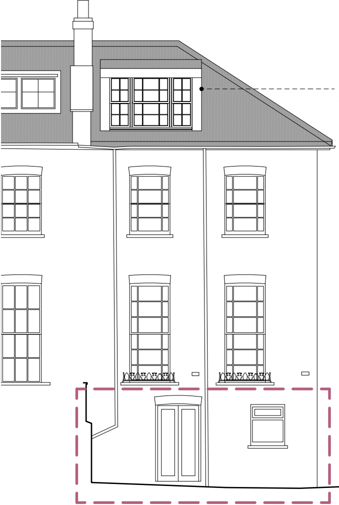
REAR ELEVATION to garden 1:100

GENERAL NOTES: This drawing is to be read in conjunction with the contract specification, the engineer's drawings and specification, and where appropriate the drawings and specifications prepared by relevant sub contractors. All works are to be undertaken in accordance with the Building Regulations and the latest British Standards and Codes of Practice. The contractor must obtain Building Control permissions as necessary and appropriate. All proprietary materials and products are to be used strictly in accordance with the manufacturers recommendations.