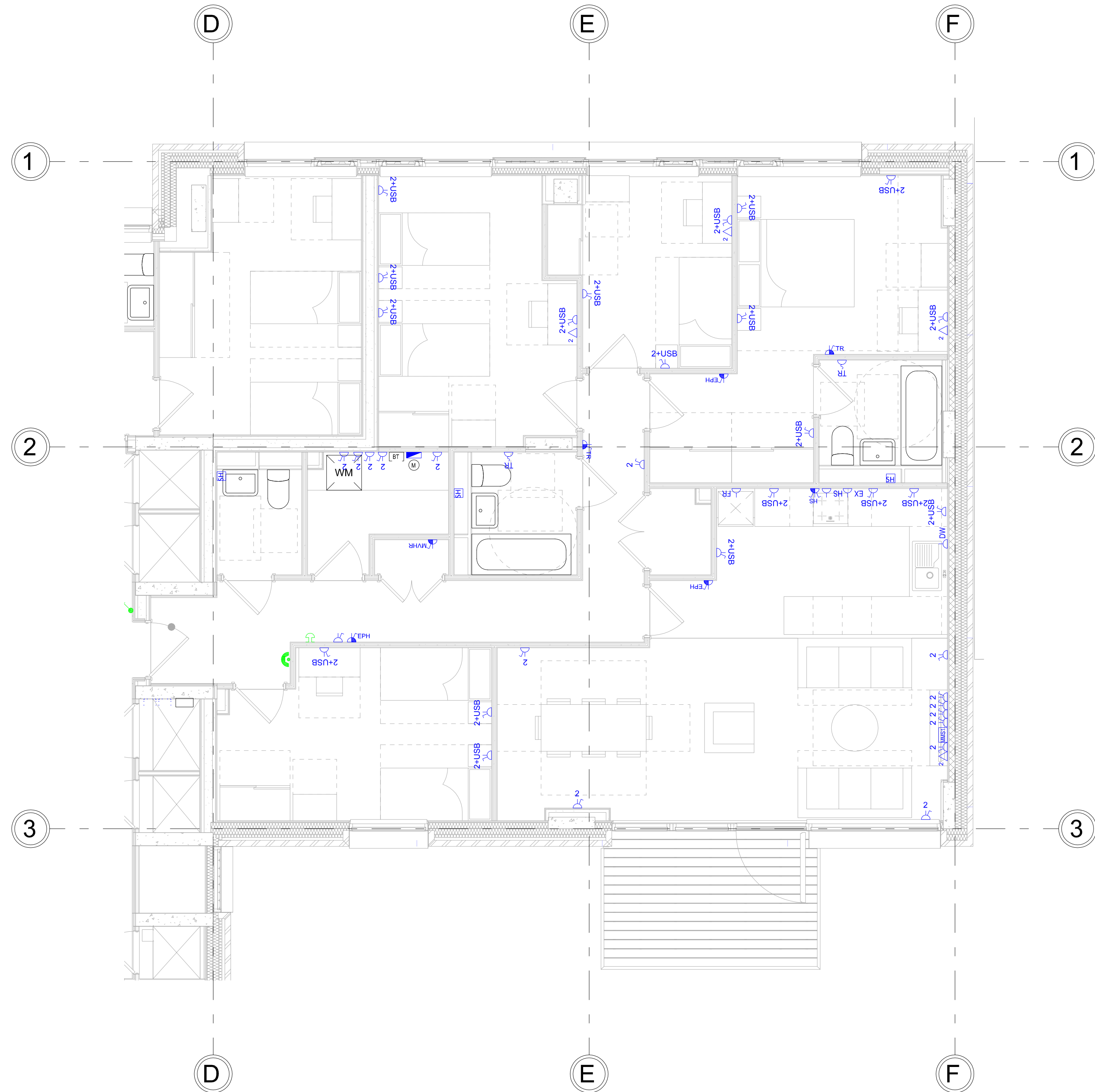
05 - Typical Apartment Type G - Small Power and AC