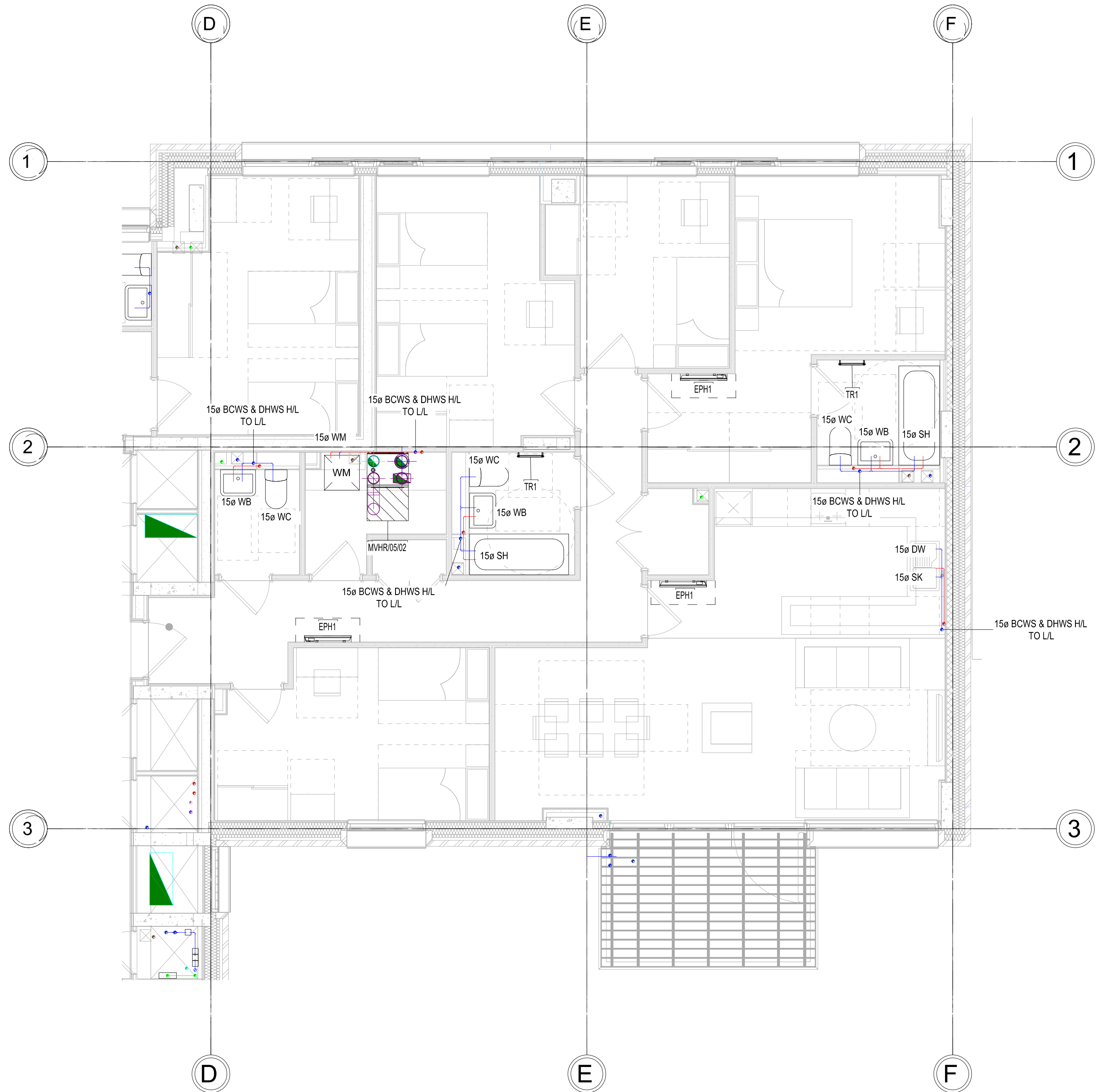
05 - Typical Apartment Type G - L/L