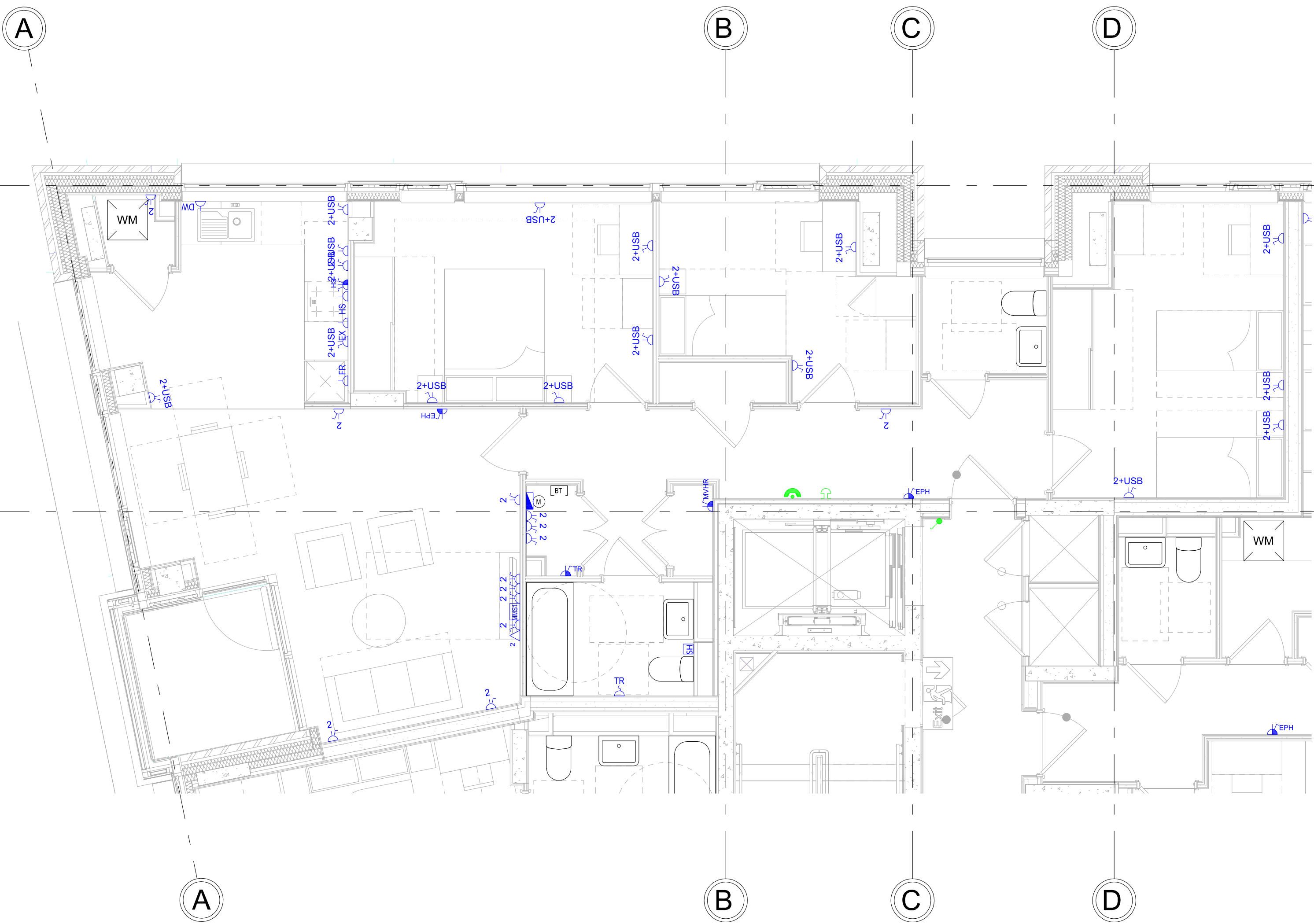
05 - Typical Apartment Type F - Small Power and AC