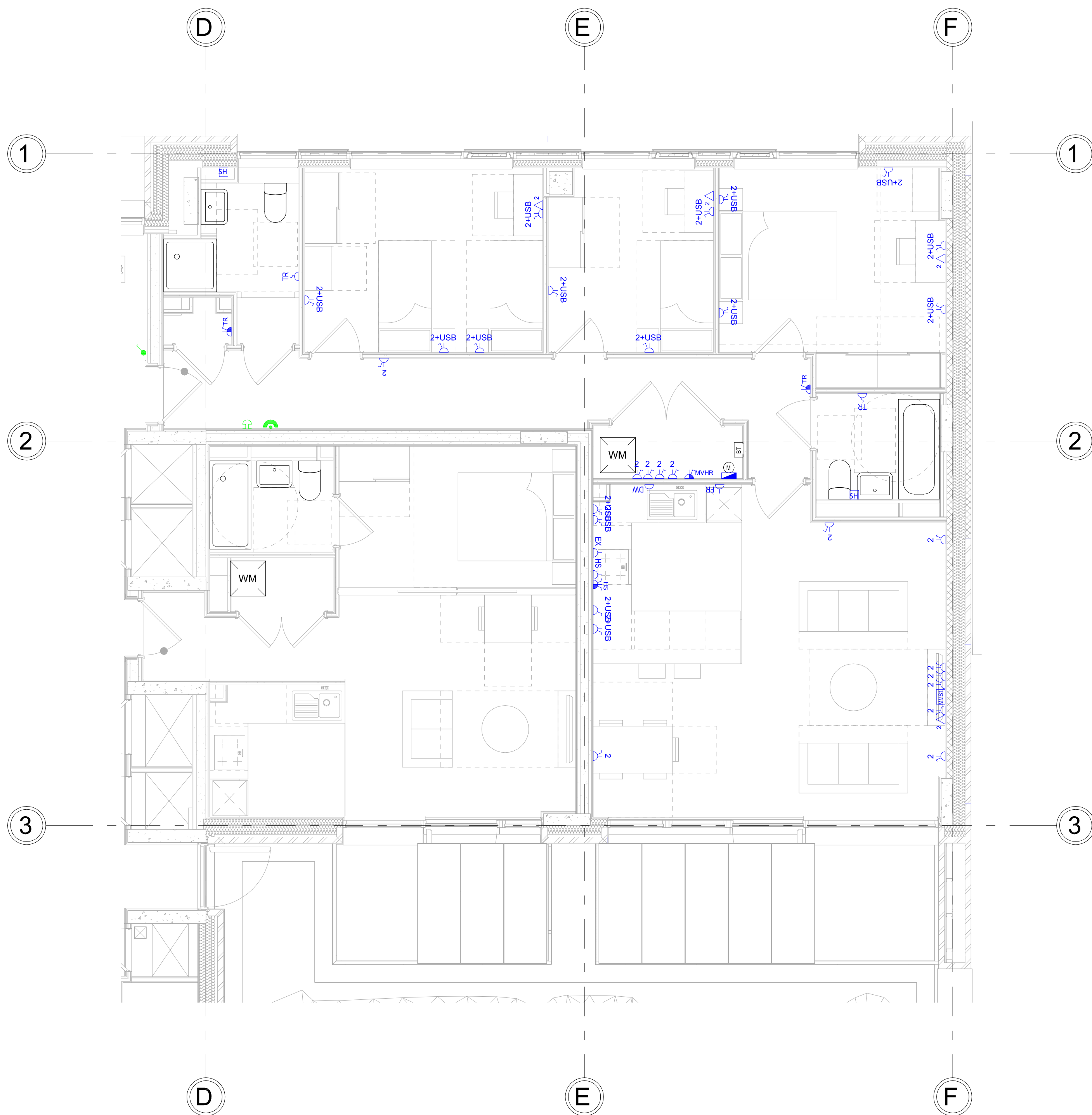
01 - Typical Apartment Type E - Small Power and AC 1 : 50