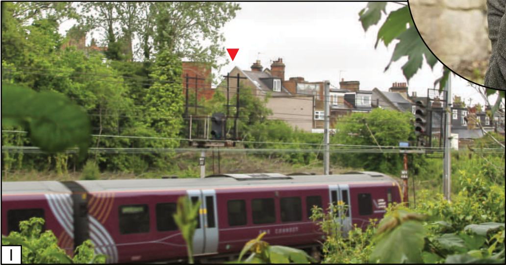
I Zoomed in view across the railway track from the hill feature.