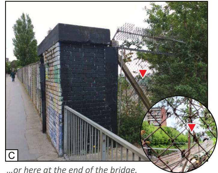
...or here at the end of the bridge.