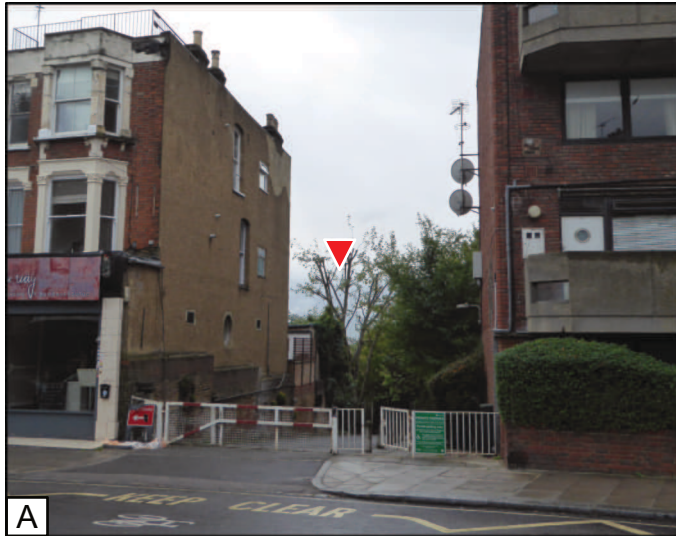
The site cannot be seen from Mill Lane here...

The rear of the site is completely surround by other buildings, walls, trees, railway infrastructure and geographical features that obstruct all possible public views of the the rear elevation; aside from a materially irrelevant view from the neglected hill feature on Wayne Kirkham Way.