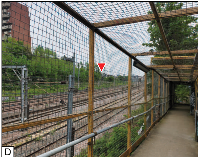
Nor can it be seen walking down the gantry...