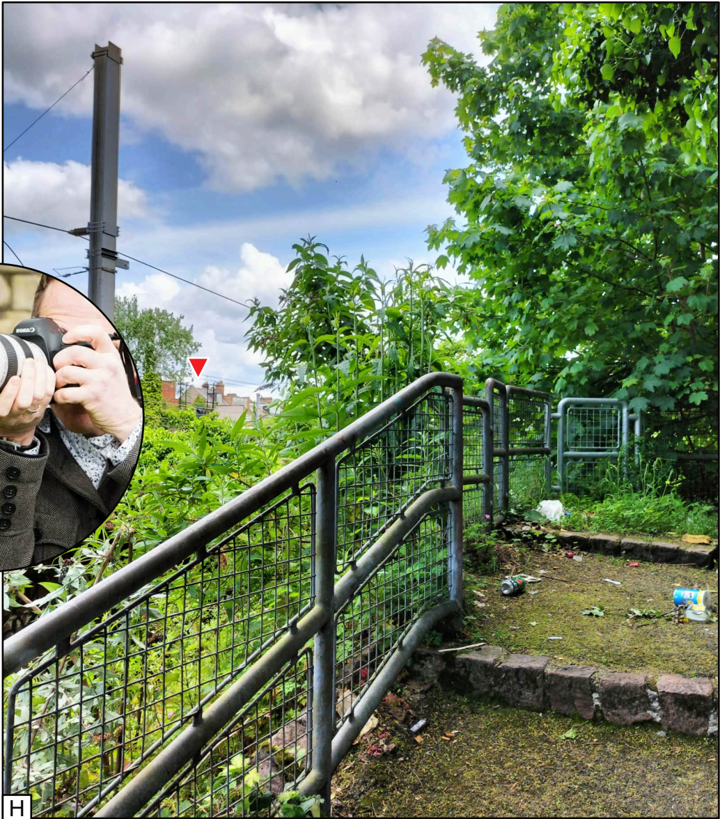
H Page 1 photograph [A] was taken from here.