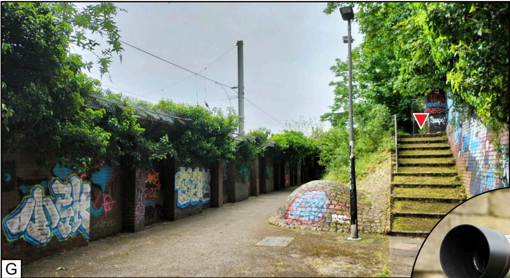
G This strange neglected hill has the only public view of the site.

The only possible public realm view or of the rear elevation is from this hill, 120m away through a zoom lens, on a neglected hill, strewn with rubbish, broken glass and dog mess.