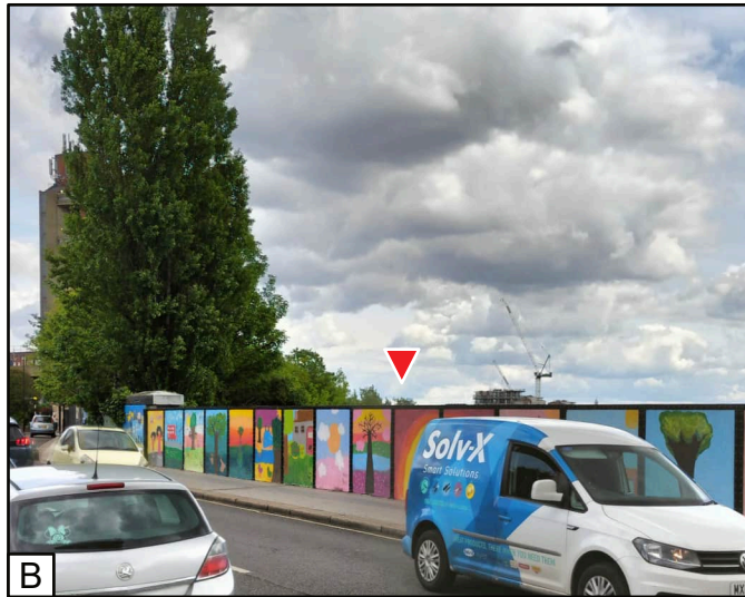
...from anywhere on Mill Lane Bridge,