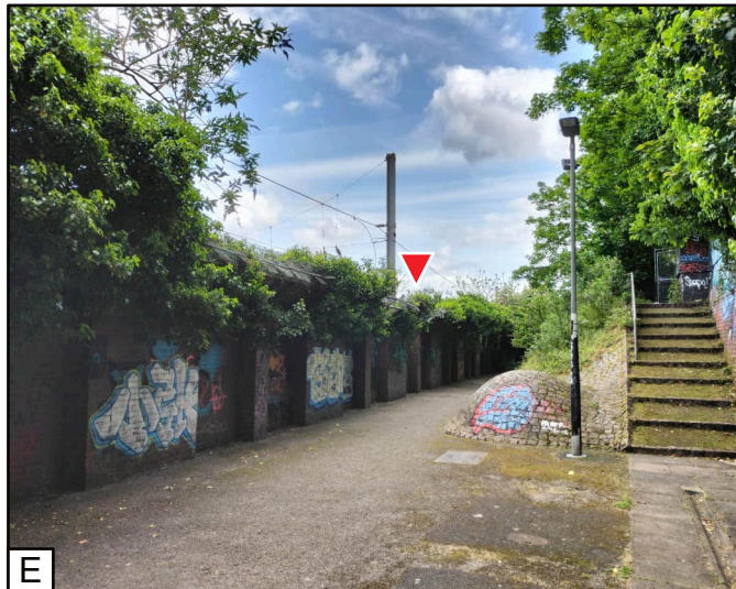
...or in normal views from Wayne Kirkham Way.