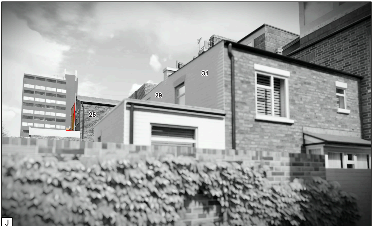
View from 33 Ravenshaw Street with Ellerton Tower beyond. Proposed development is 23m away.

...and 33 will see almost nothing at all.