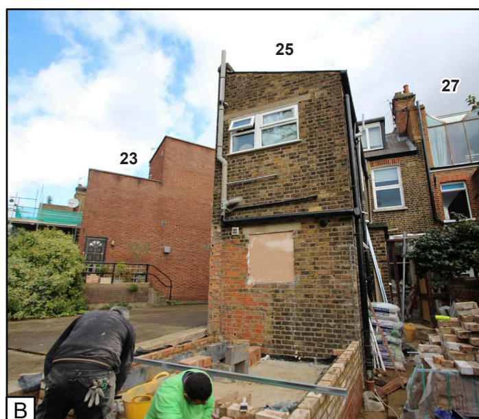
Photo from the near the back of the garden showing additional extension to 25A under construction.