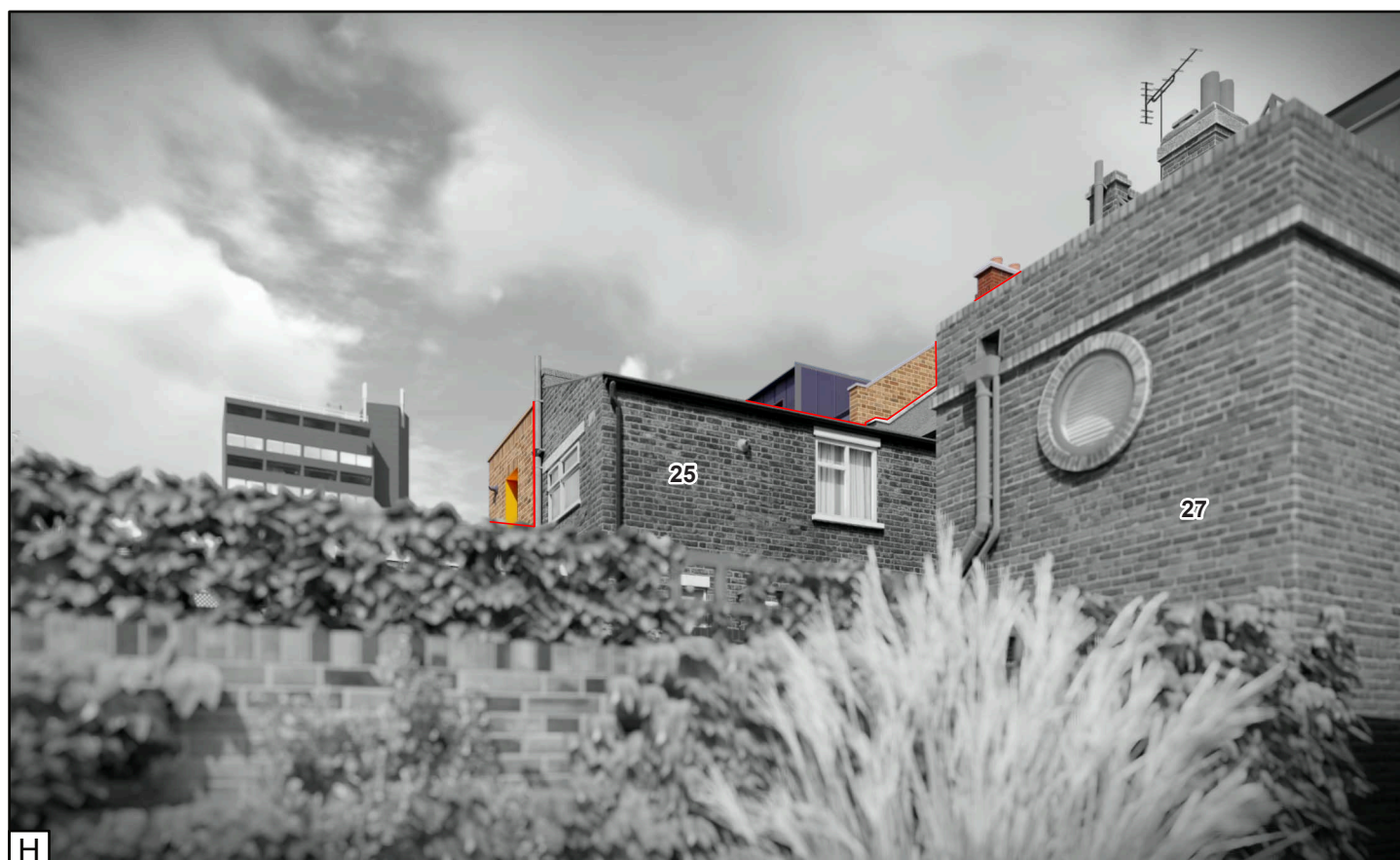
View from 29 Ravenshaw Street with Ellerton Tower beyond; proposed development shown in colour.

The garden of 29 will see glimpses of the proposal.