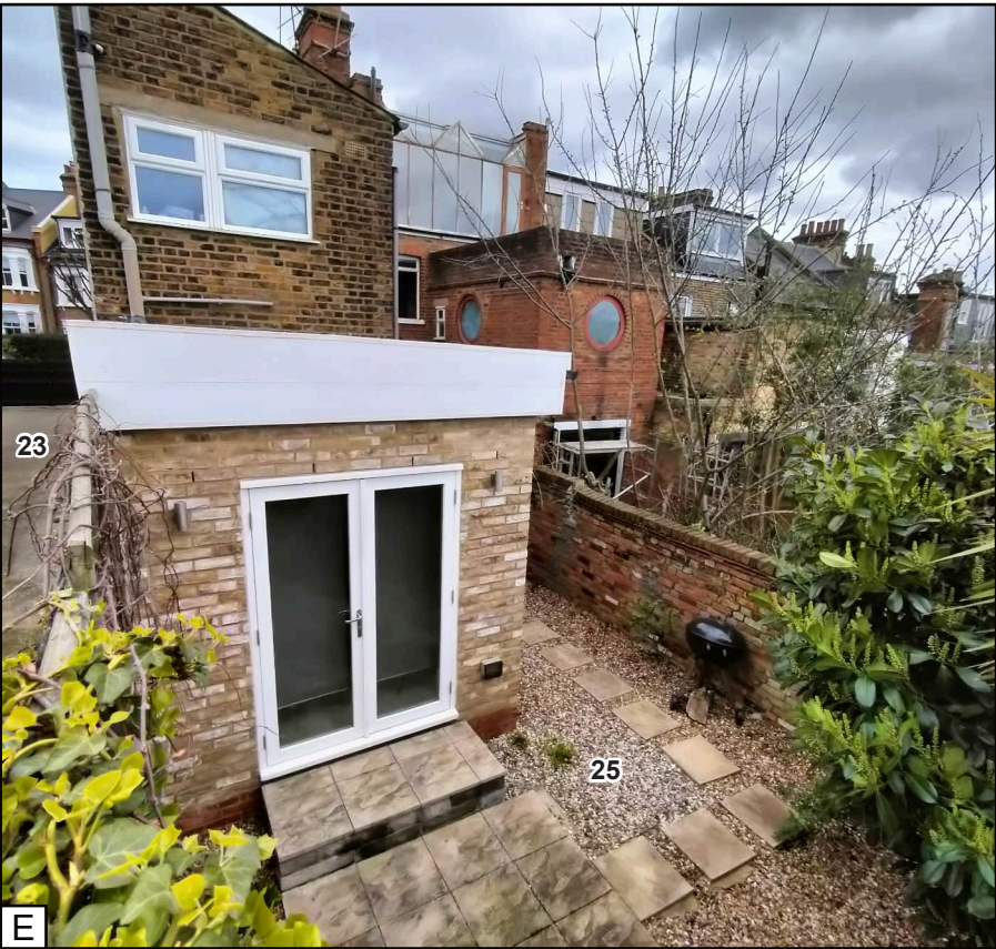
CGI D shows an eye level view of the proposed development, seen from the patio area of 25A. From this position, once the fence is replaced, the proposed development will be barely even discernible from this viewpoint. Also, as with view A, the proposed roof dormers will not be seen either. Photos E and F show the existing extension and garden at 25A and the positions of the CGI viewpoints.