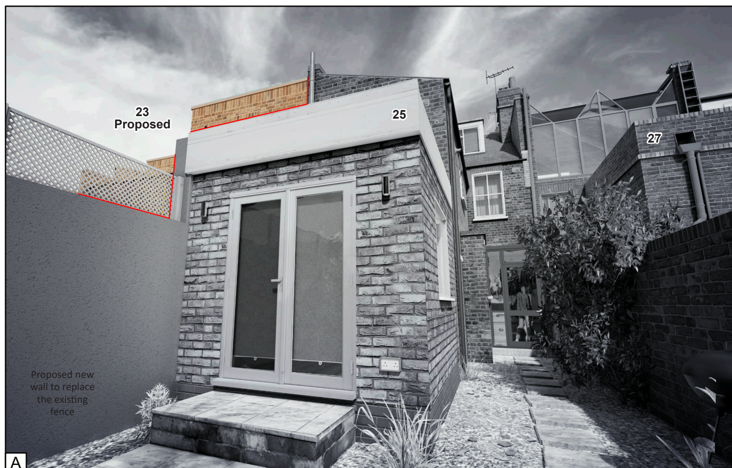
CGI A is a view of the proposed development from the very back of the garden of 25A. It shows that the development would have only the most minor impact on 25A's amenity even from the far back of the garden.

as glimpsed from this viewpoint. Claims of harm, overbearing, overlooking, overshadowing, or loss of privacy or amenity have no basis in reality and cannot be made without resorting to hyperbole and wilfully ignoring the actual material facts.