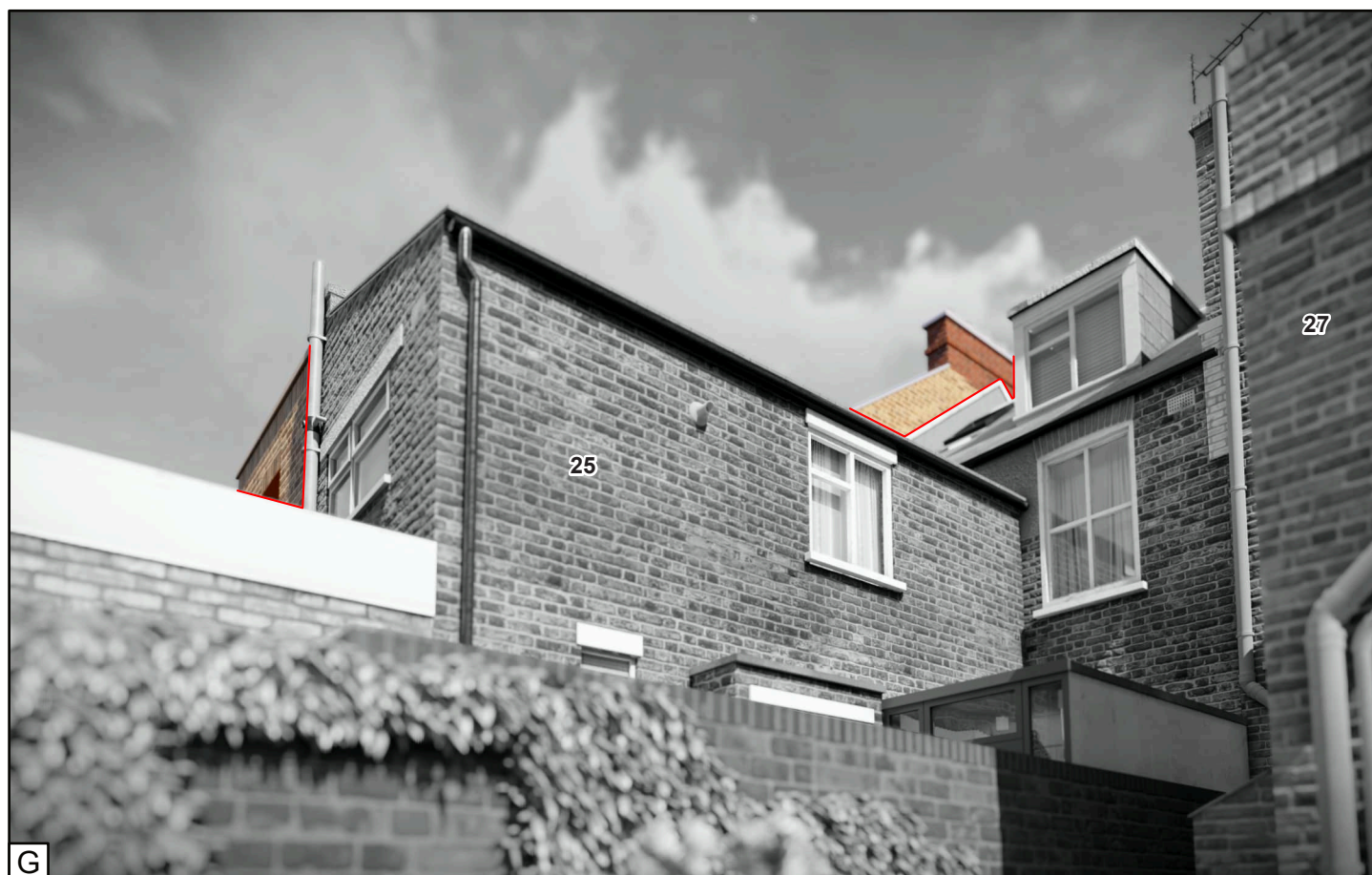
View from 27 Ravenshaw Street with the proposed development shown in colour.

Impact on the garden of 27 is barely perceptible.