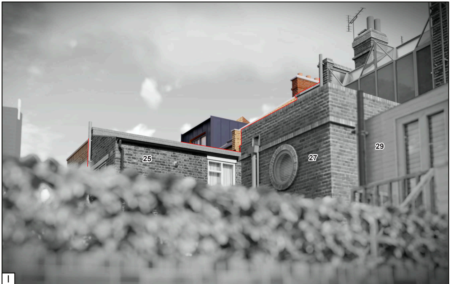
View from 31 Ravenshaw Street with Ellerton Tower beyond; development shown in colour 18m away.