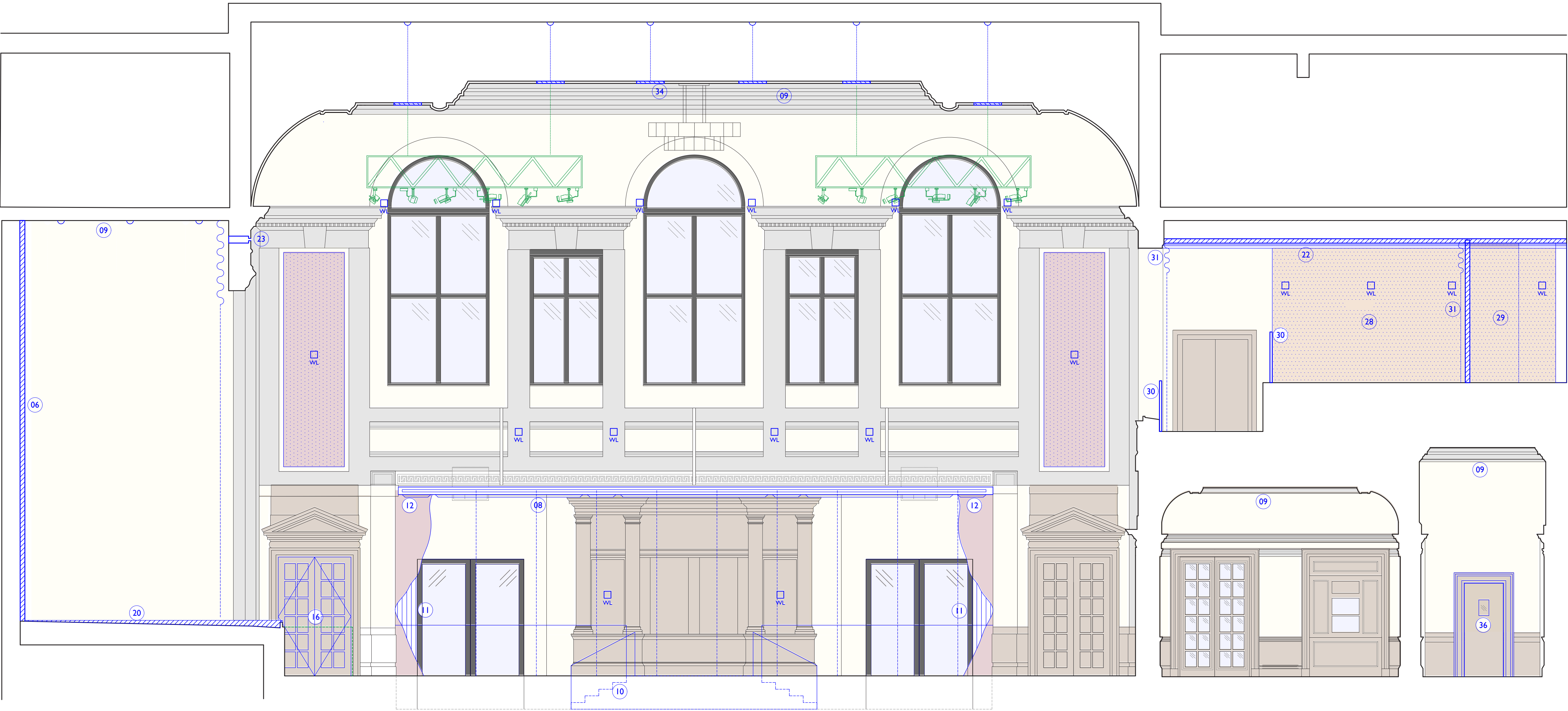
1 4003 PROPOSED CAMDEN CENTRE ELEVATION 1 1:50 @ A1