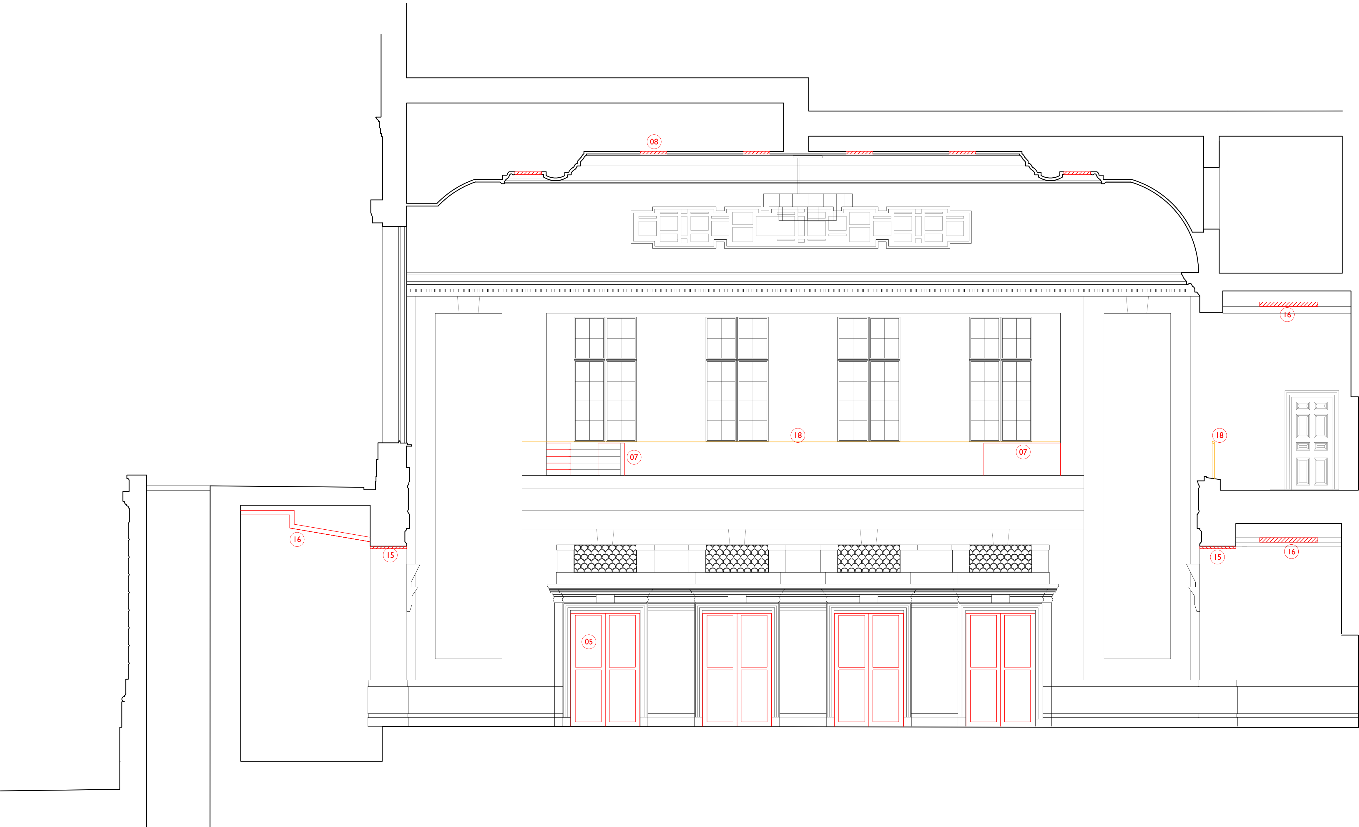
1 DEMOLITION CAMDEN CENTRE ELEVATION 2 3004 1:50 @ A1