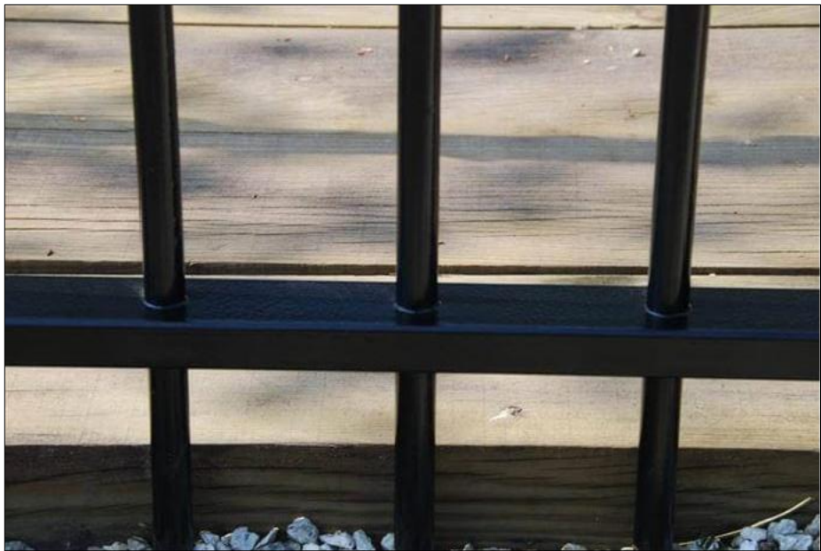
METAL RAILING REFERENCE PHOTO

Galvanised and black powder coated steel railing with square posts and tubular semi pale-through rail construction