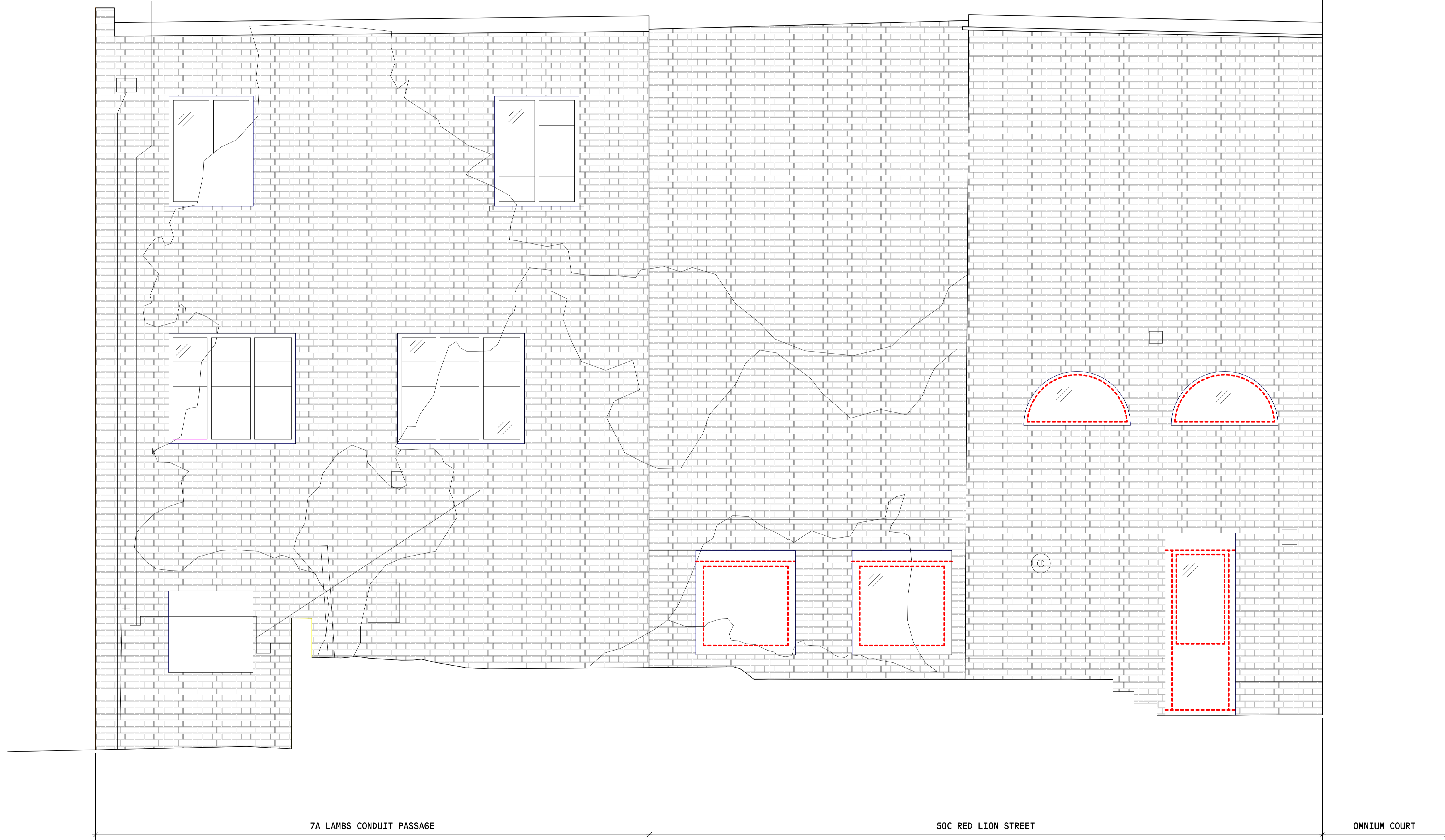
1 DEMOLITION ELEVATION 1 - FRONT 1:25