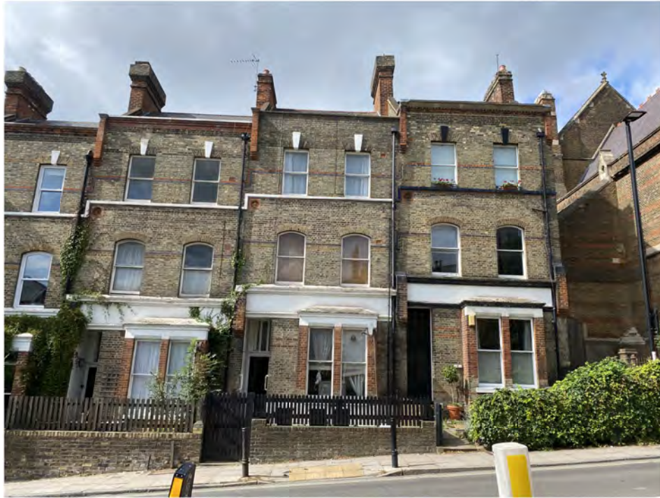
1. EXISTING SITE PHOTOGRAPH (FRONT ELEVATION)