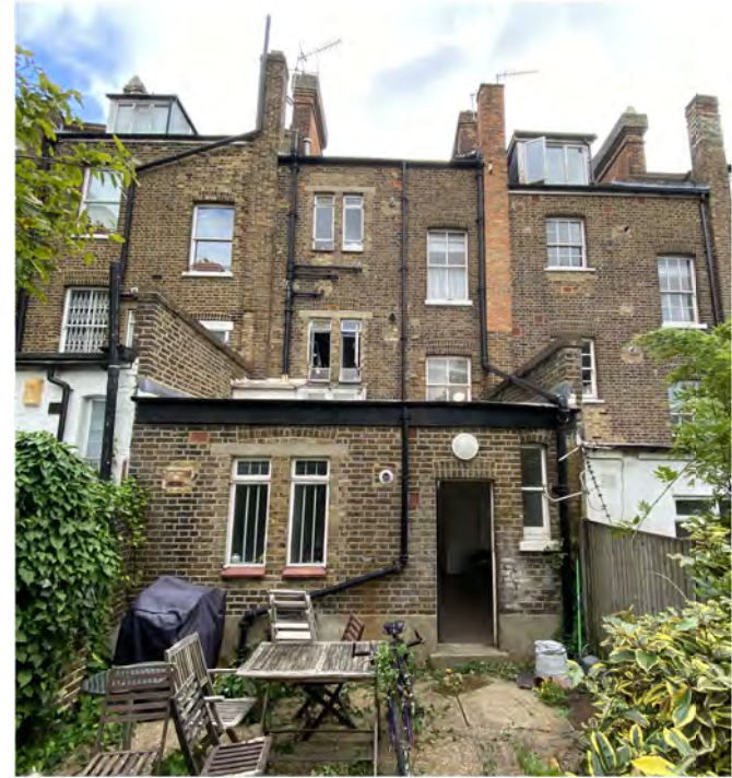
2. EXISTING SITE PHOTOGRAPH (REAR ELEVATION)