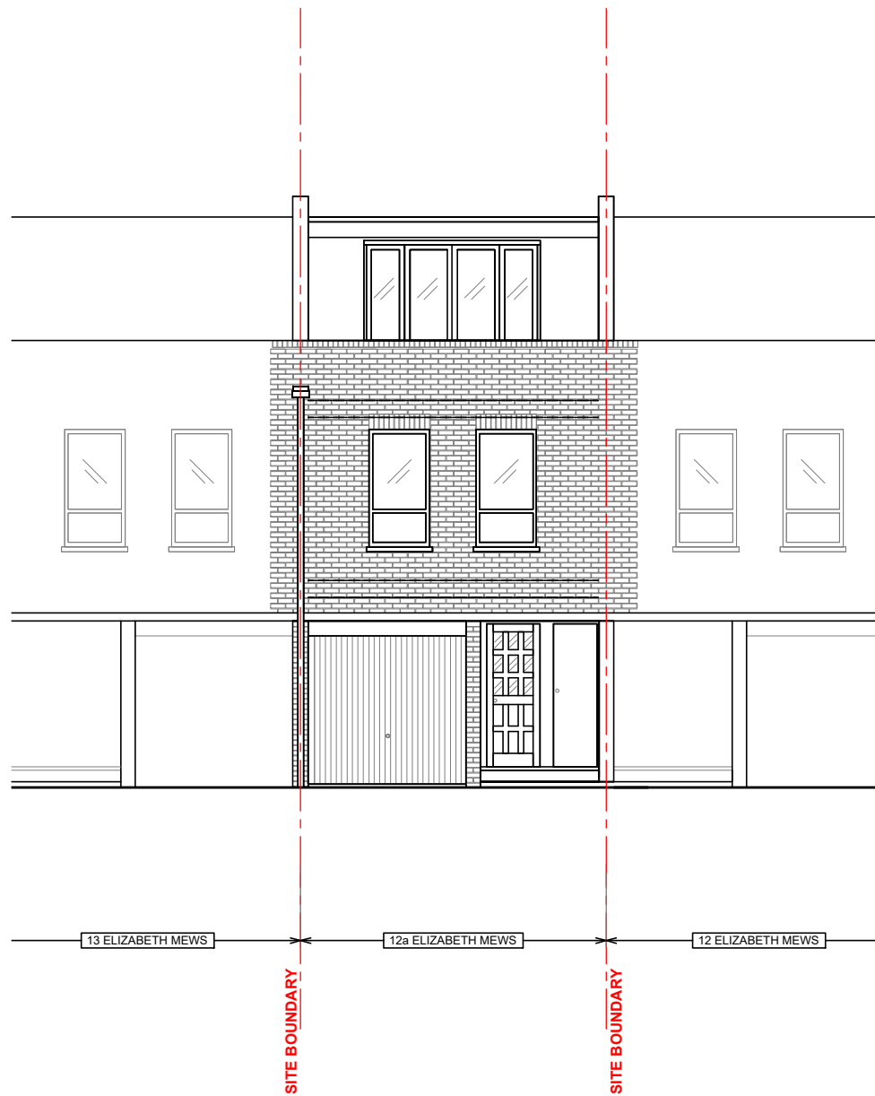
1 FRONT ELEVATION - EXISTING_ SCALE 1:100 @ A3