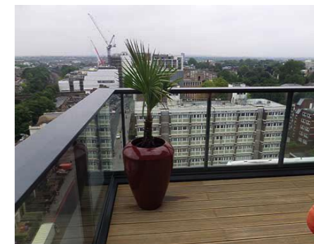
1100mm HIGH BALUSTRADE