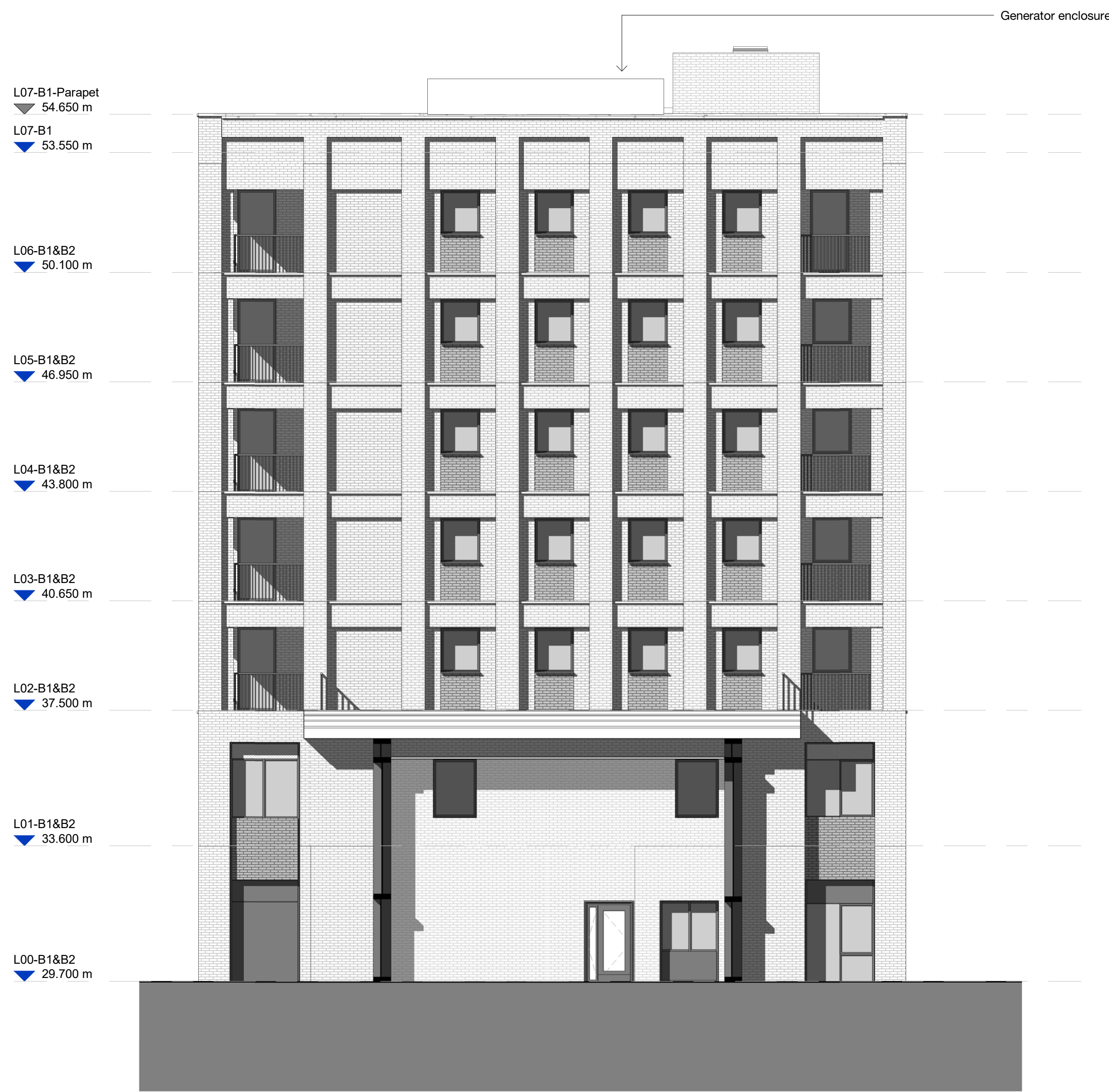
2 Internal Elevation East