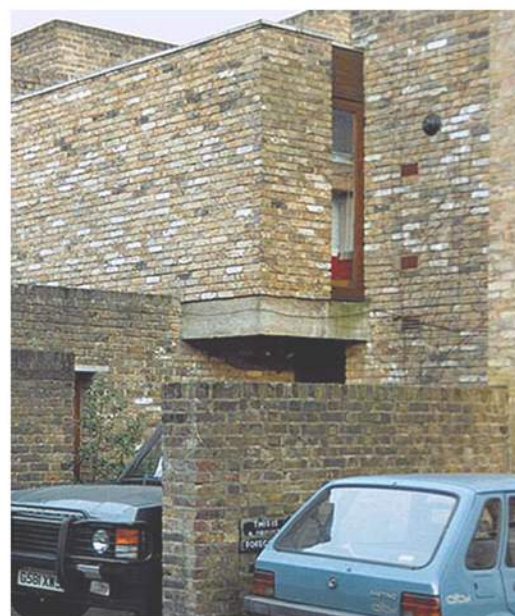
22 Murray Mews Precedent