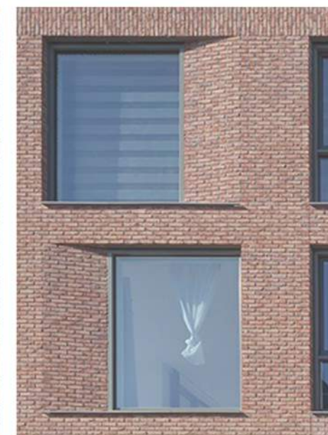
Deep window reveals

tasou associates architects + structural engineers