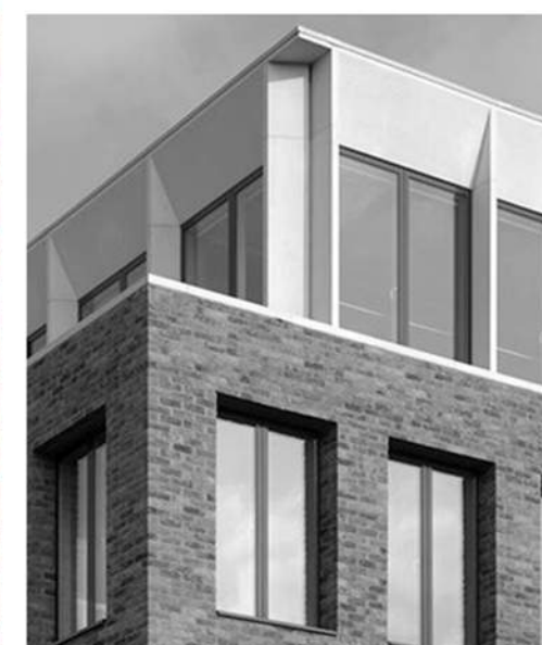
Top Floor glazing and parapet detail

tasou associates architects + structural engineers