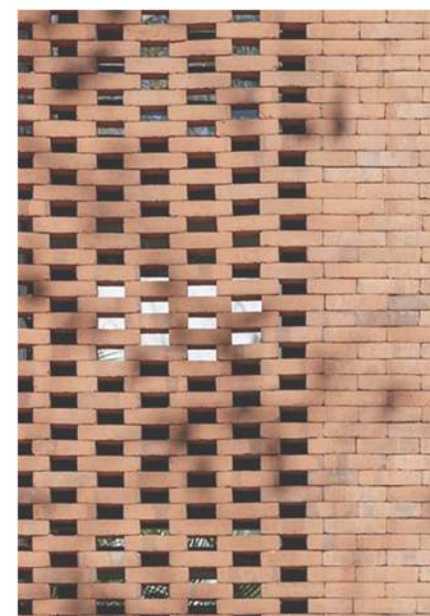
Hit and Miss brickwork