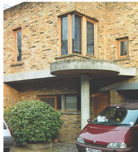
30 Murray Mews Precedent