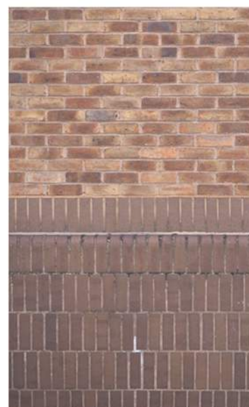
Murray Mews, vertical brickwork