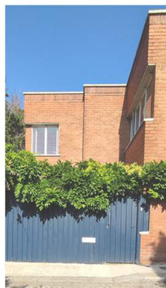
15-19 Murray Mews