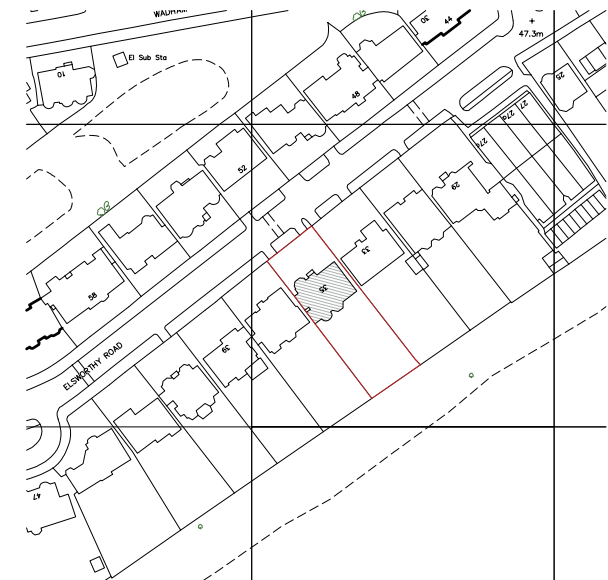
SITE BOUNDARY OUTLINED IN RED