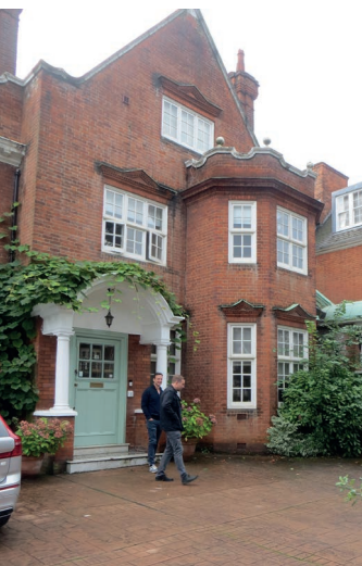
Photo of the house prior to refurbishment works