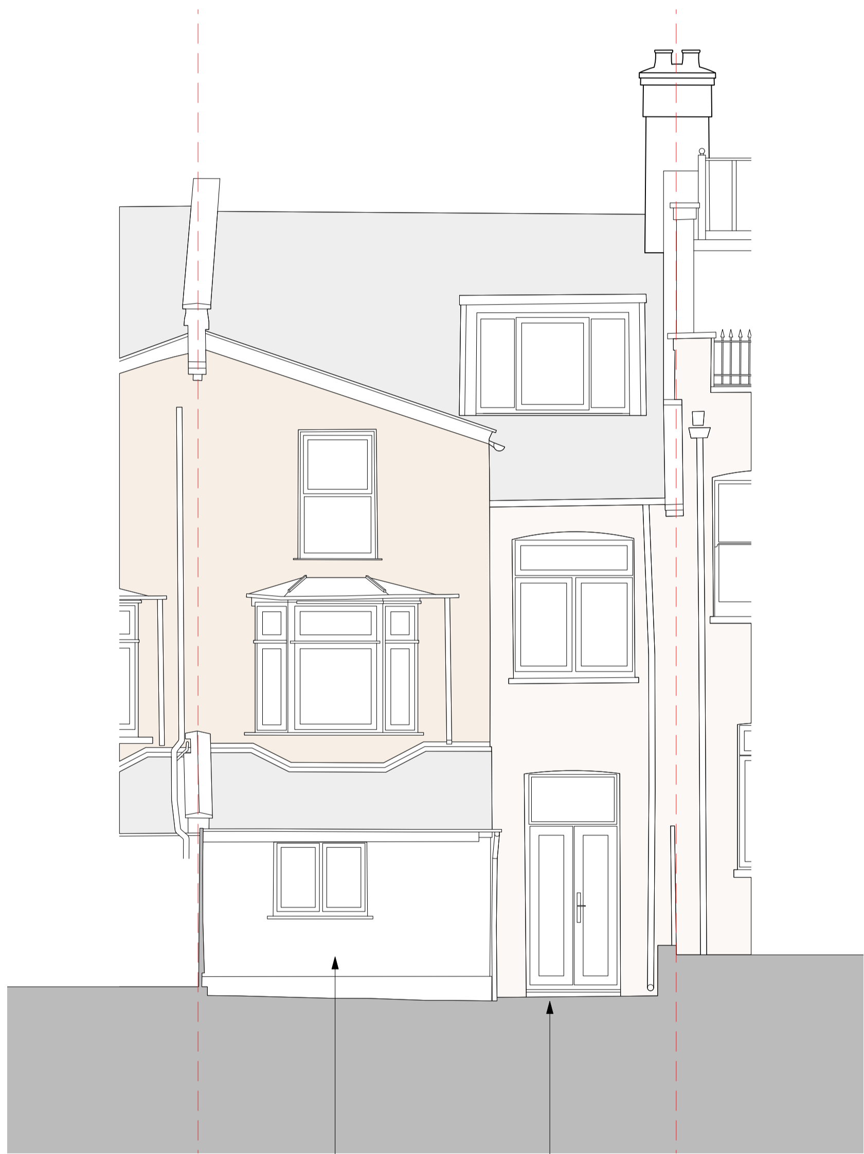
1 Existing Rear Elevation Scale: 1:50

Ground level alongside rear wing at lower level than garden. Existing lean-to rear extension.