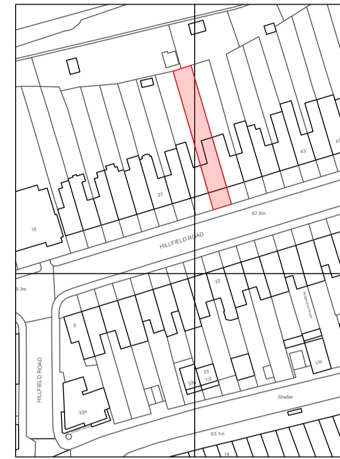
2 Existing Site Location Plan Scale: 1:1250

Do not scale. Use figured dimensions only. All dimensions to be checked on site. All drawings to be read in conjunction with the Structural Engineer's drawings.