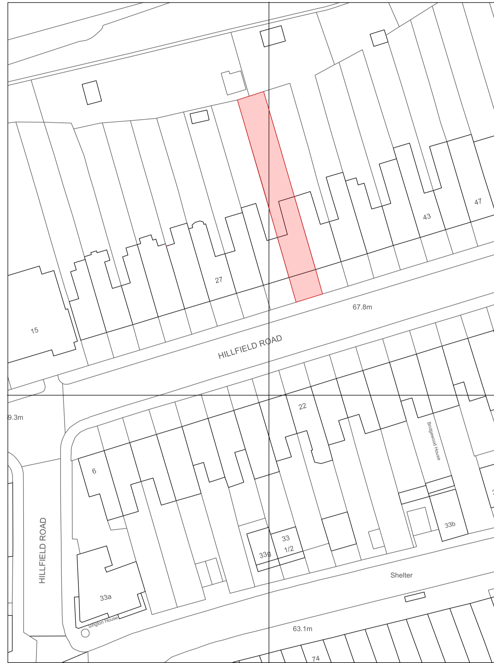
1 Existing Site Location Plan Scale: 1:500