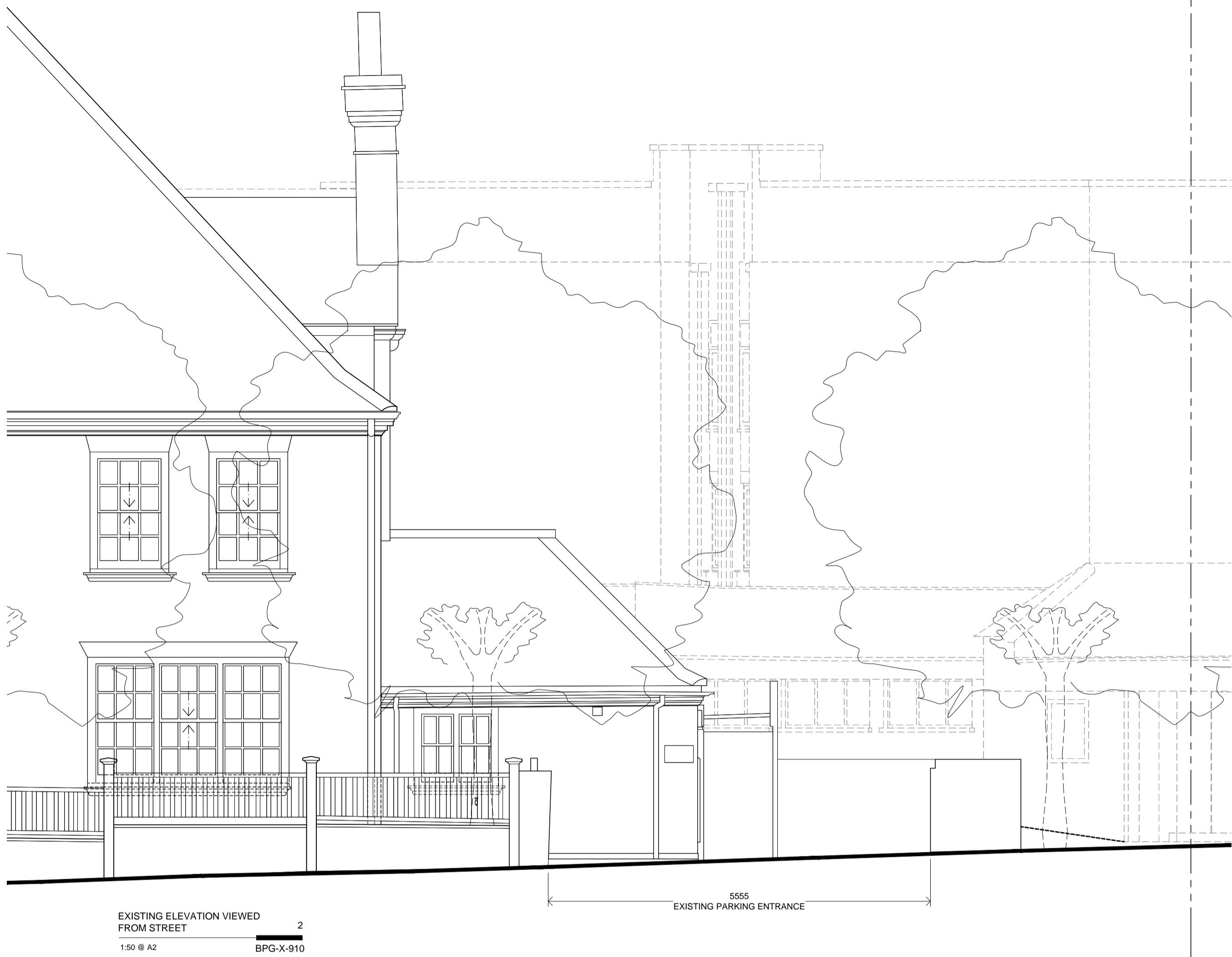
EXISTING ELEVATION VIEWED FROM STREET 1:50 @ A2 BPG-X-910