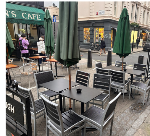
Furniture, tables and umbrellas (view from Museum Street)