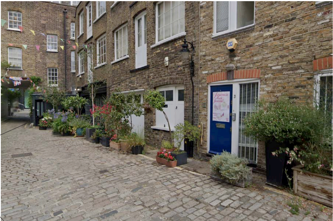
View North showing properties along the East side