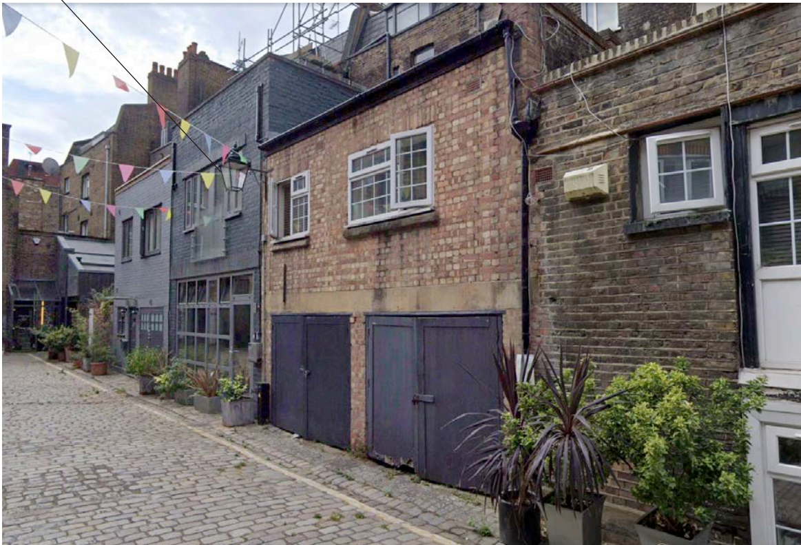
View South showing properties along the West side

Existing light fittings mounted off the façades of adjoining buildings