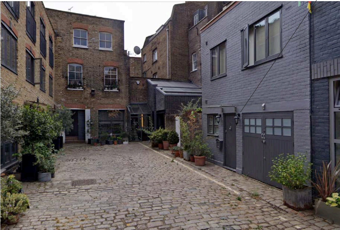
View South at the end of Warren Mews