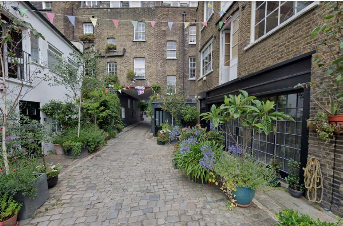
View North towards Warren St, 15 Warren Mews on the left