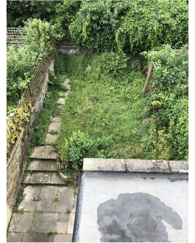
EXISTING REAR GARDEN VIEW