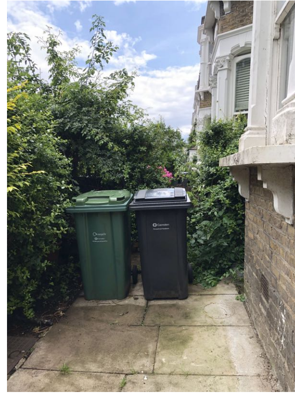
EXISTING FRONT GARDEN VIEW