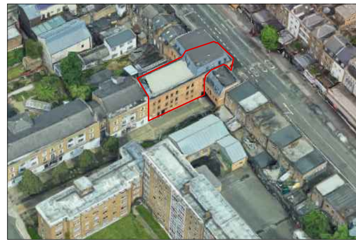
[03] AERIAL VIEW (NORTH)