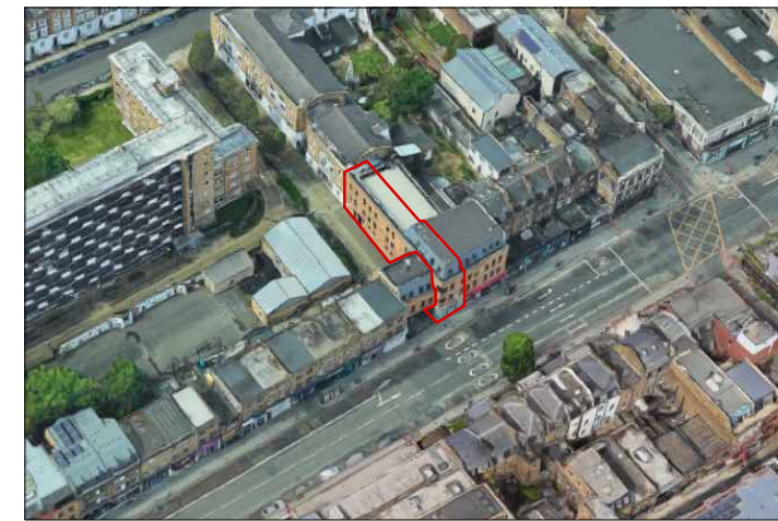
[04] AERIAL VIEW (EAST)