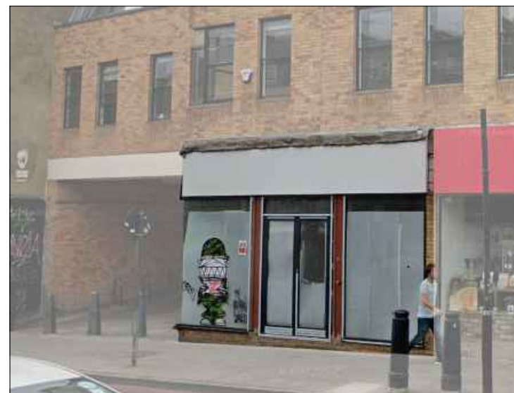
[05] EXISTING SITE PHOTOS