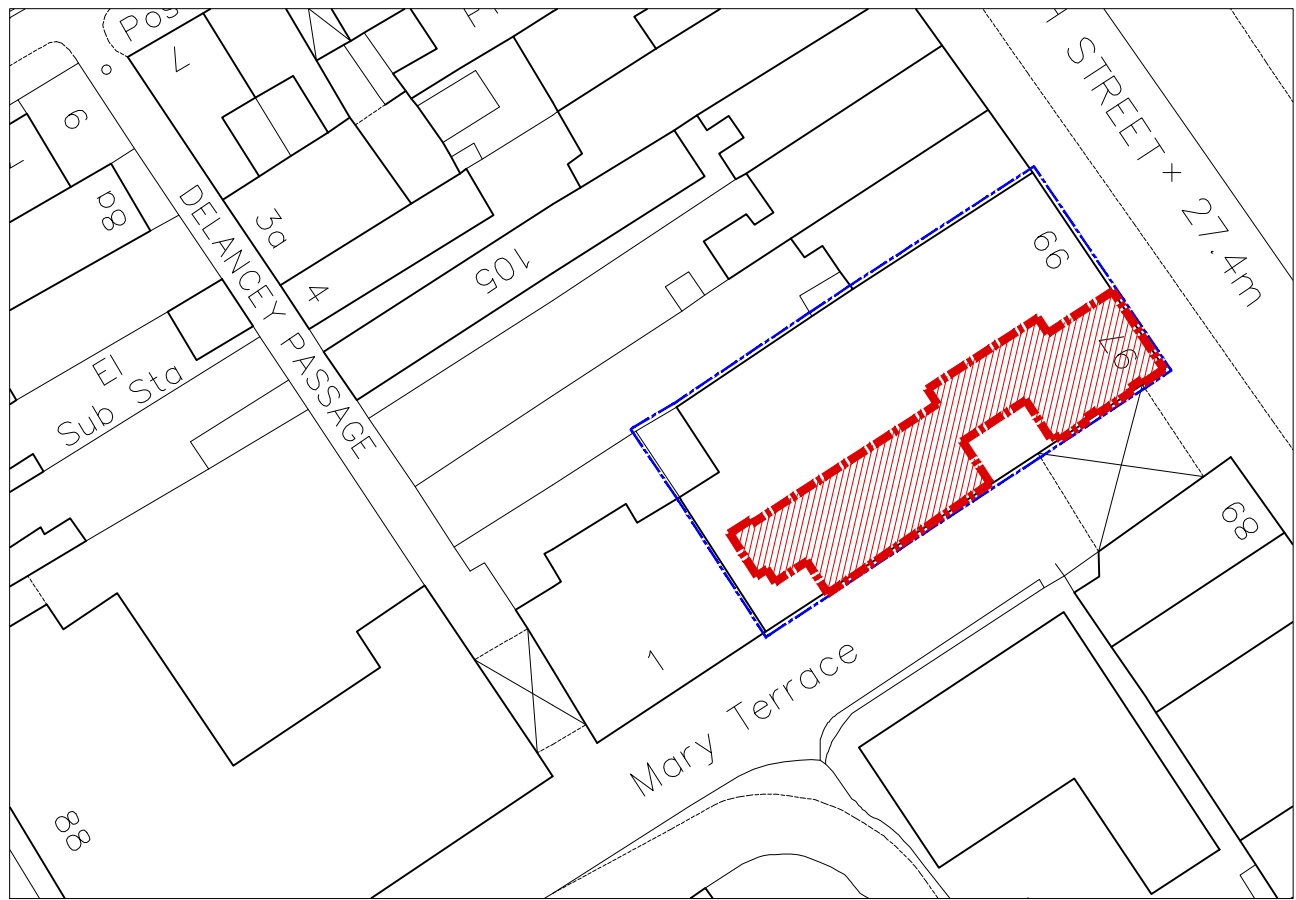
[02] EXISTING SITE PLAN