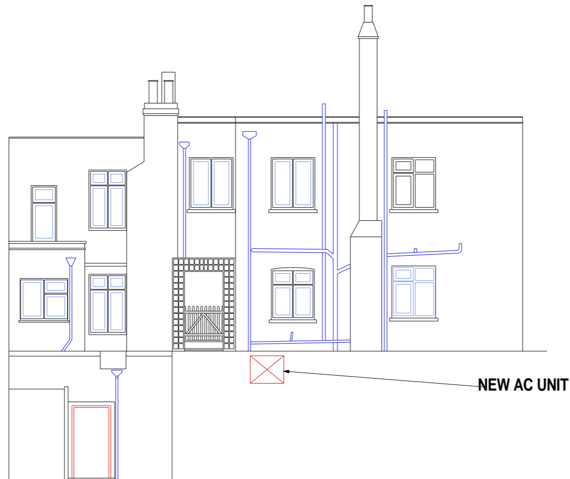
REAR ELEVATION (SECTIONAL ELEVATION AT BB)