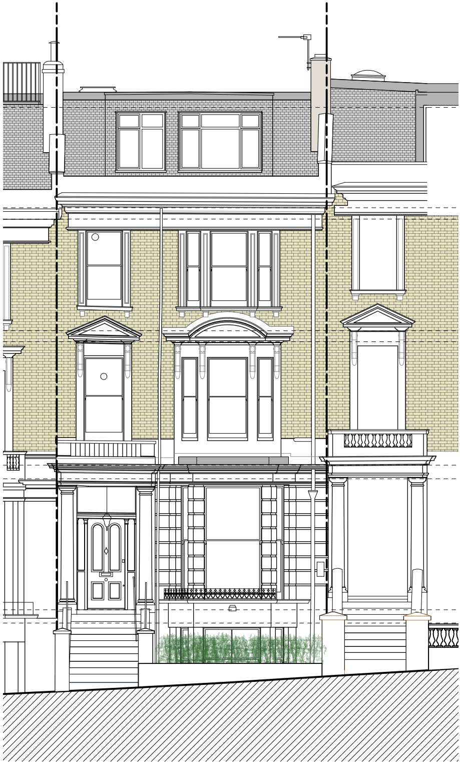
Front Elevation from Belsize Crescent