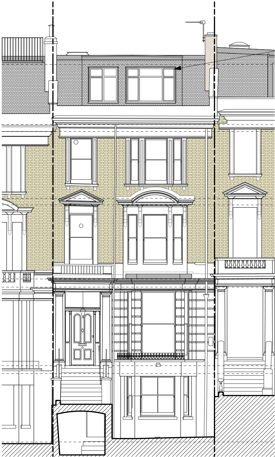
Front Elevation through lightwell