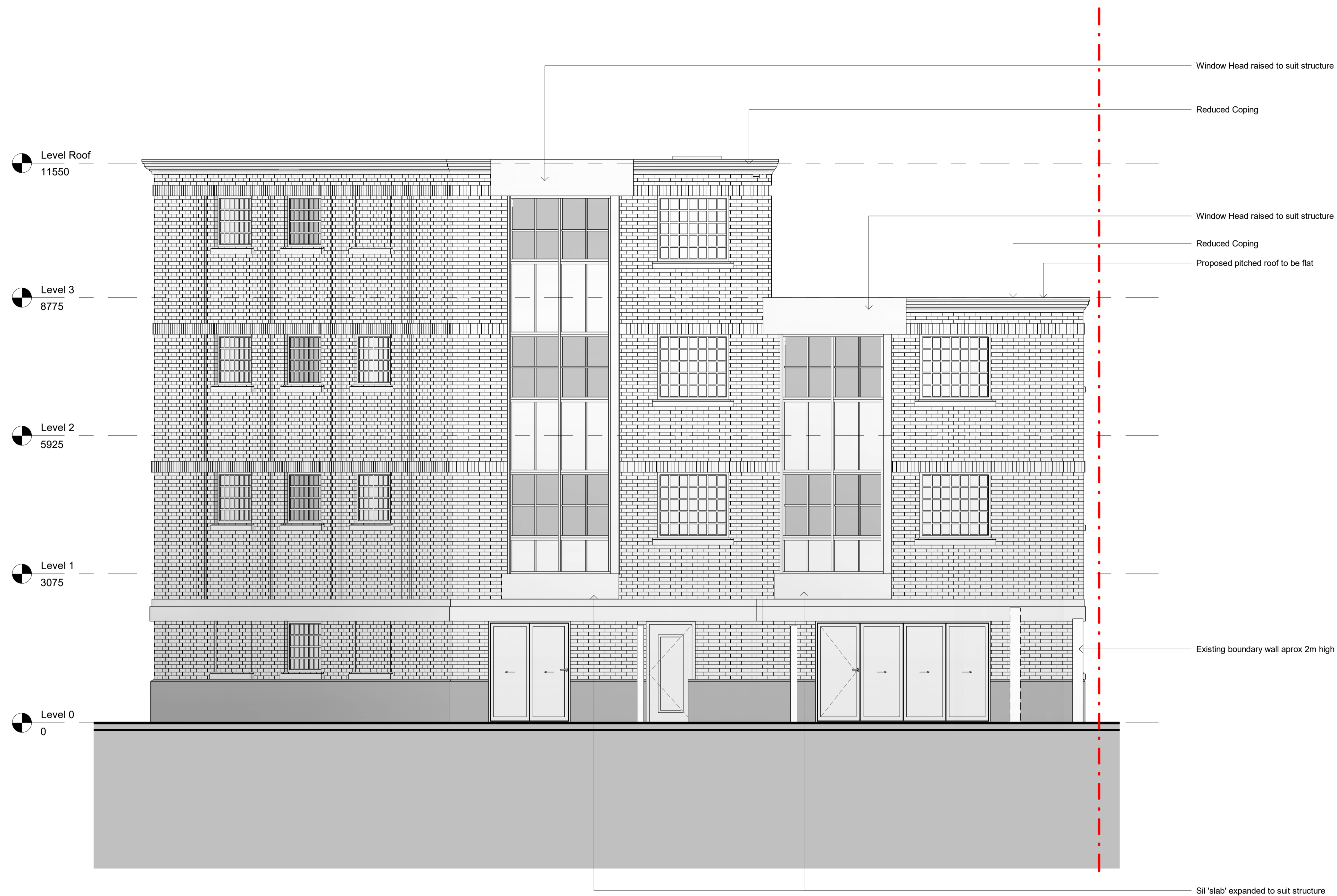
South Elevation 1 : 50