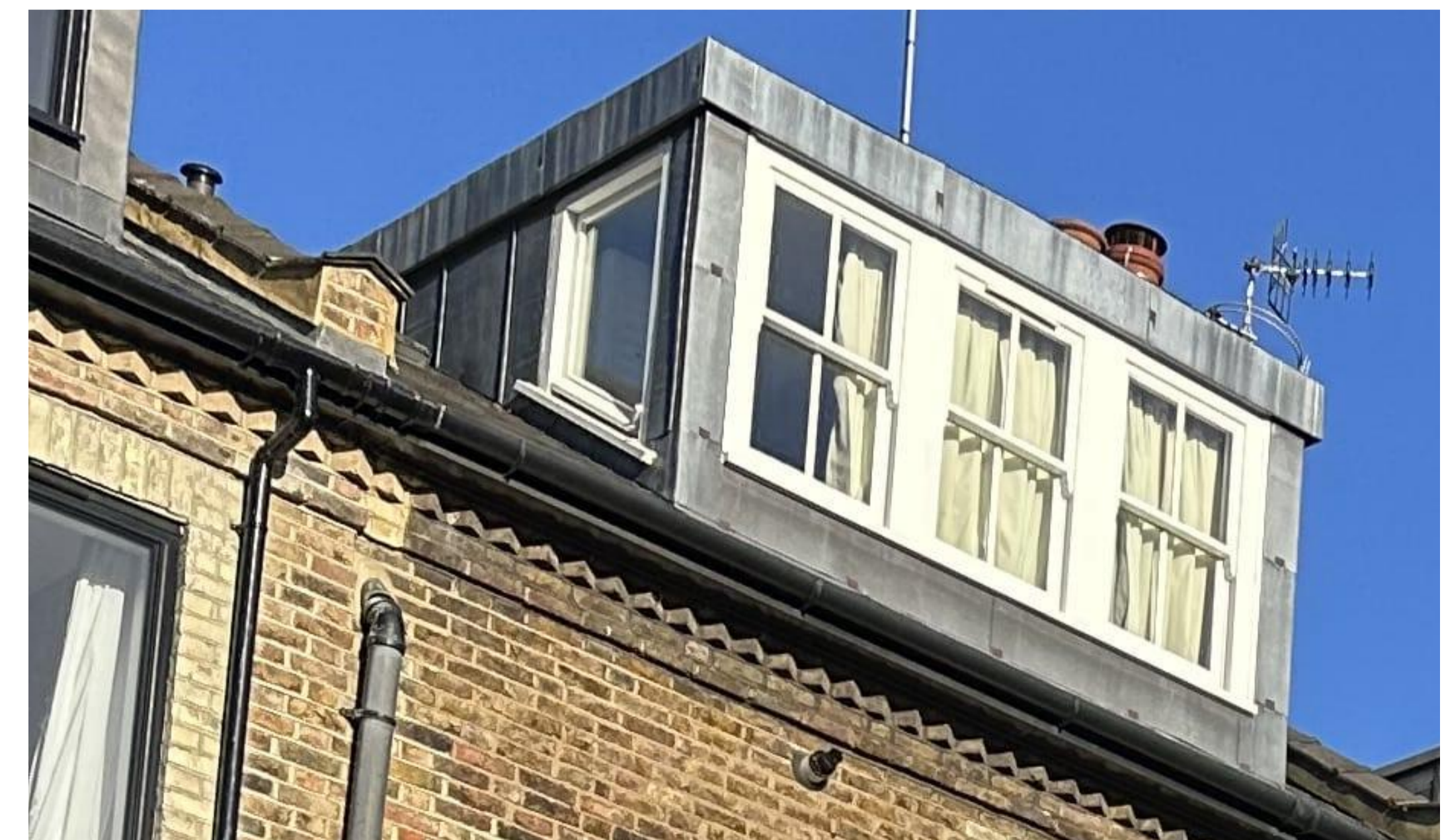
4 Front and Rear elevation - 31 Christchurch Hill

This drawing is not to be scaled for construction purposes. All dimensions are to be checked on site before any work is put in hand. If in doubt, ask.