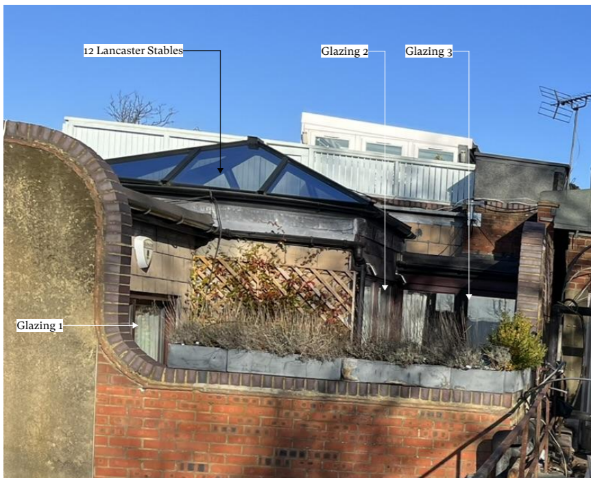
B Site photo of 12 Lancaster Stables amenity space (SK) 240122