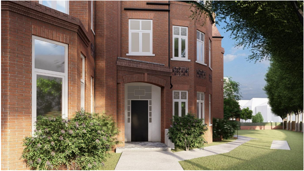
Figure 9. Existing view of main entrance and front garden.