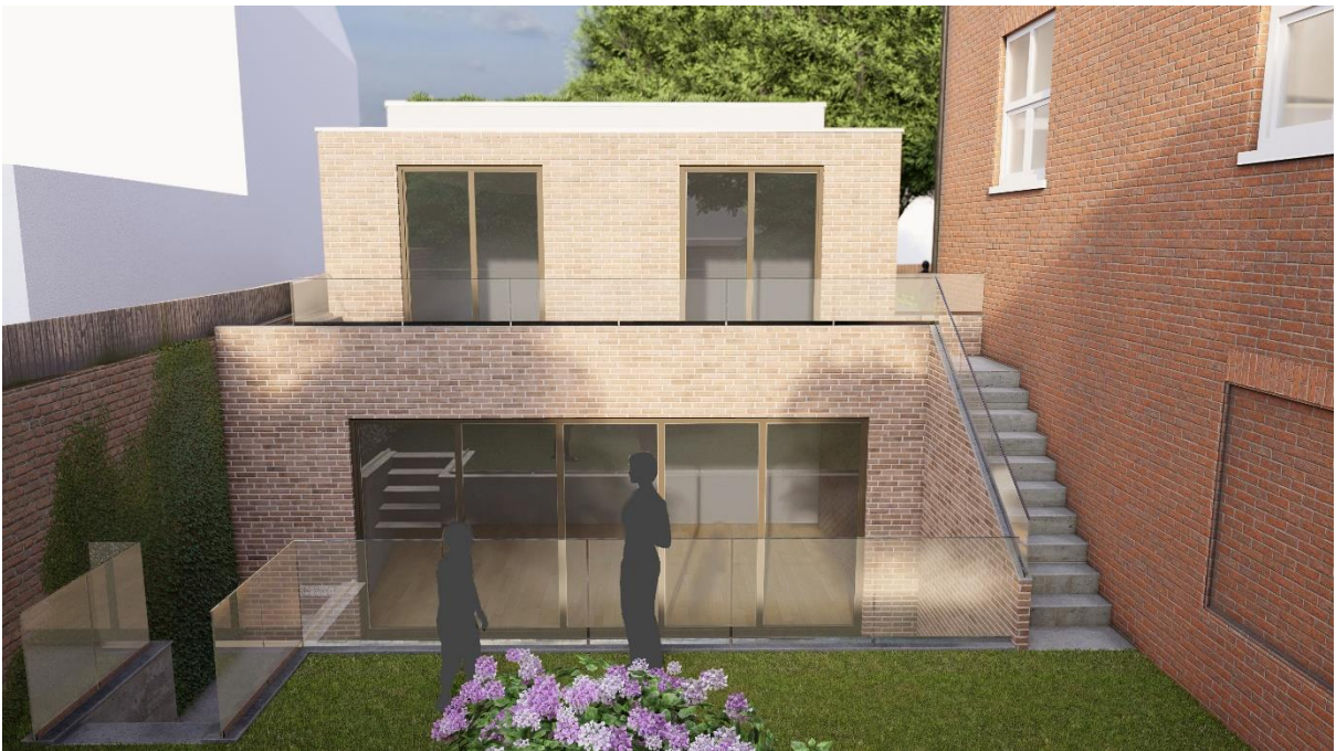
Figure 18. Proposed Rear (north) view of the new house.