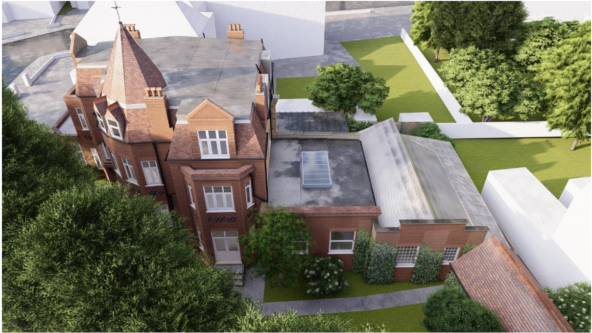
Figure 3. Existing Southern Aspect.