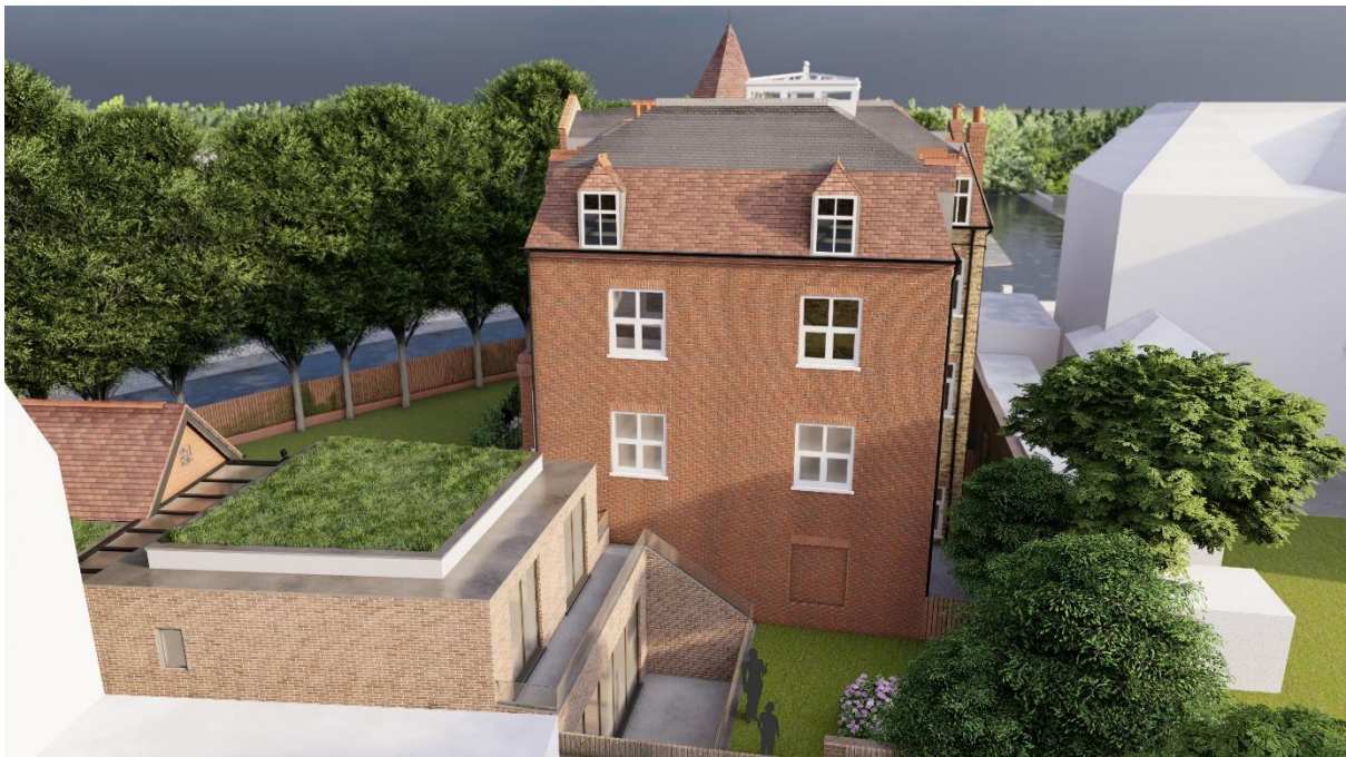
Figure 14. Proposed view from the East.