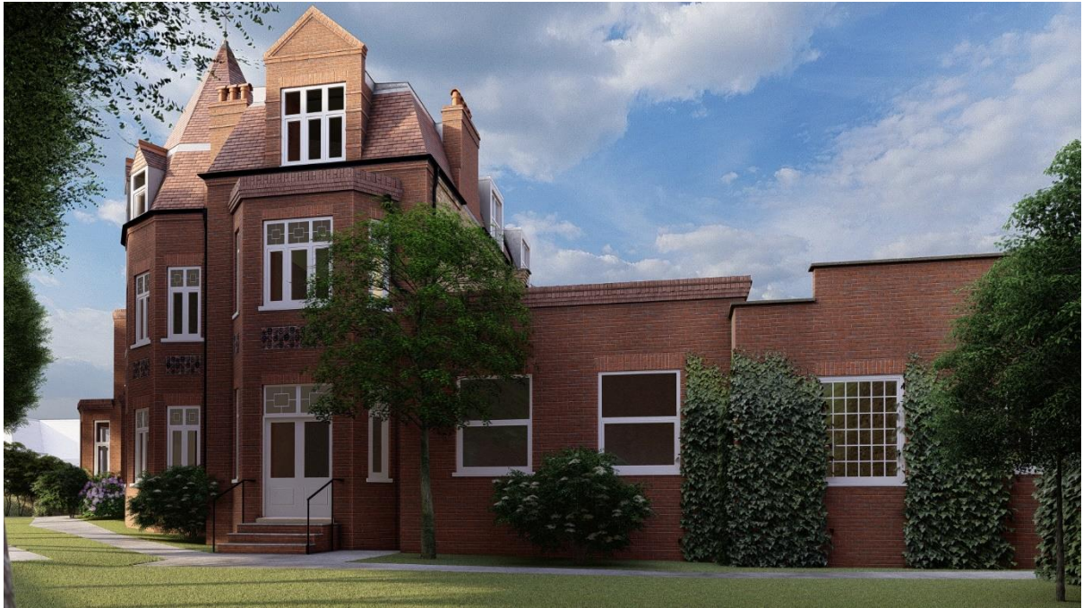
Figure 7. Existing South view.