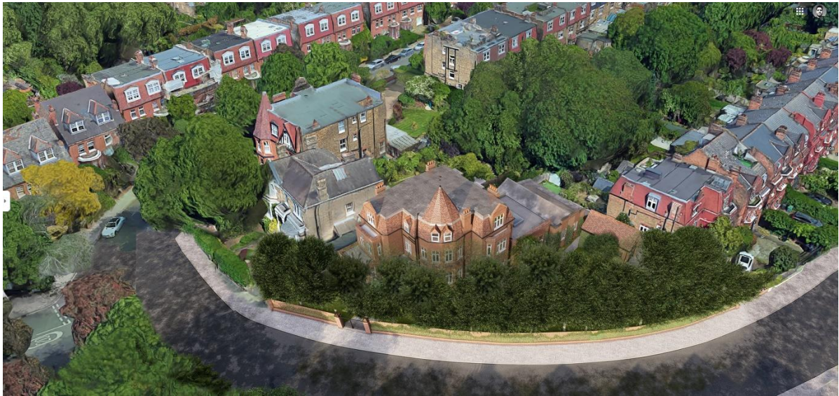
Figure 1. Existing panoramic view.