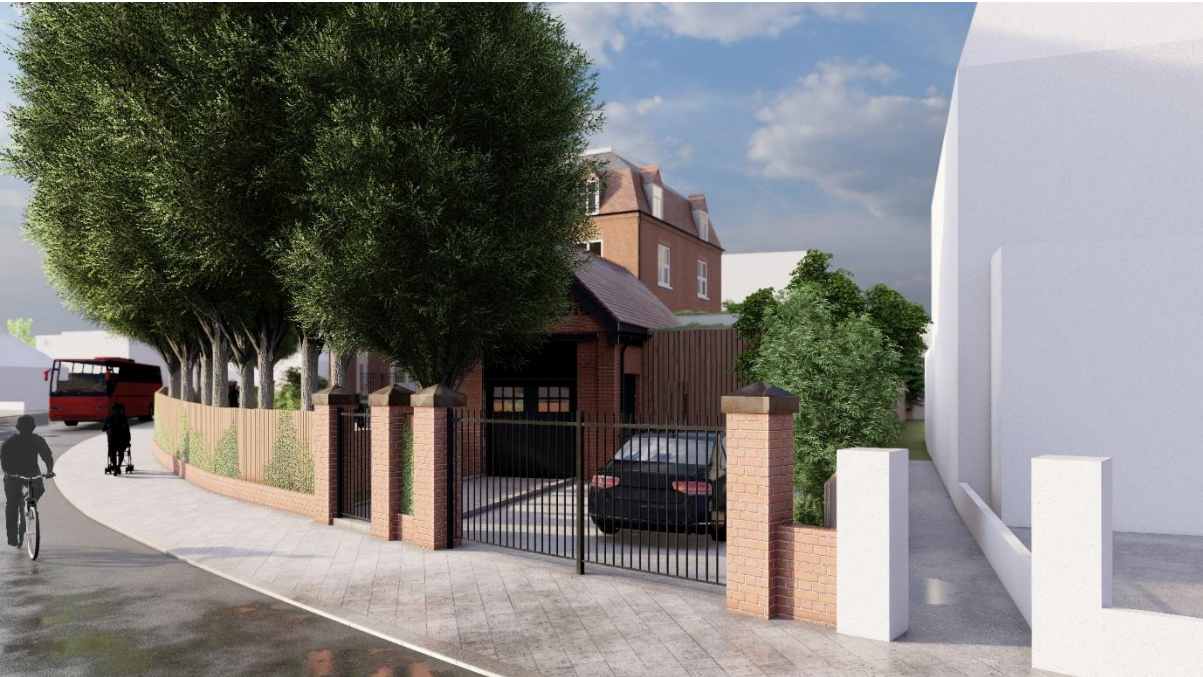
Figure 12. Proposed street view from the east.