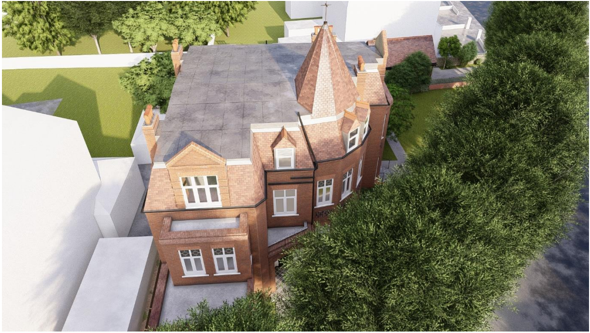
Figure 5. Existing Western aspect.