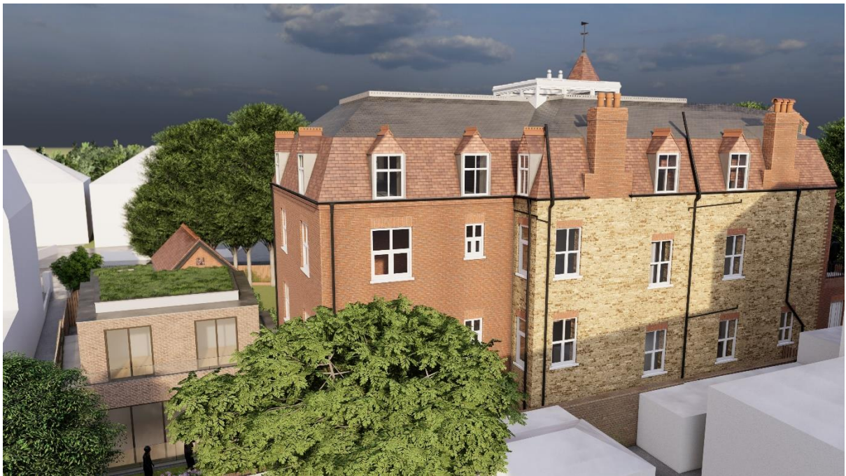
Figure 16. Proposed Rear (north) view.