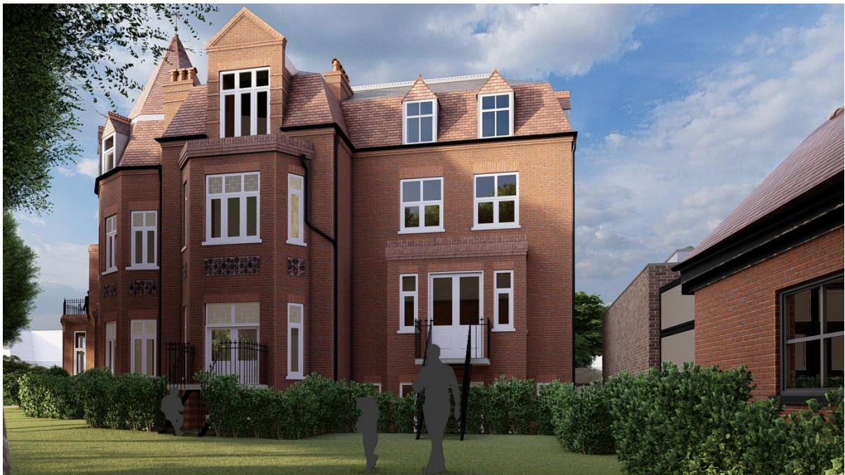
Figure 8. Proposed South view.