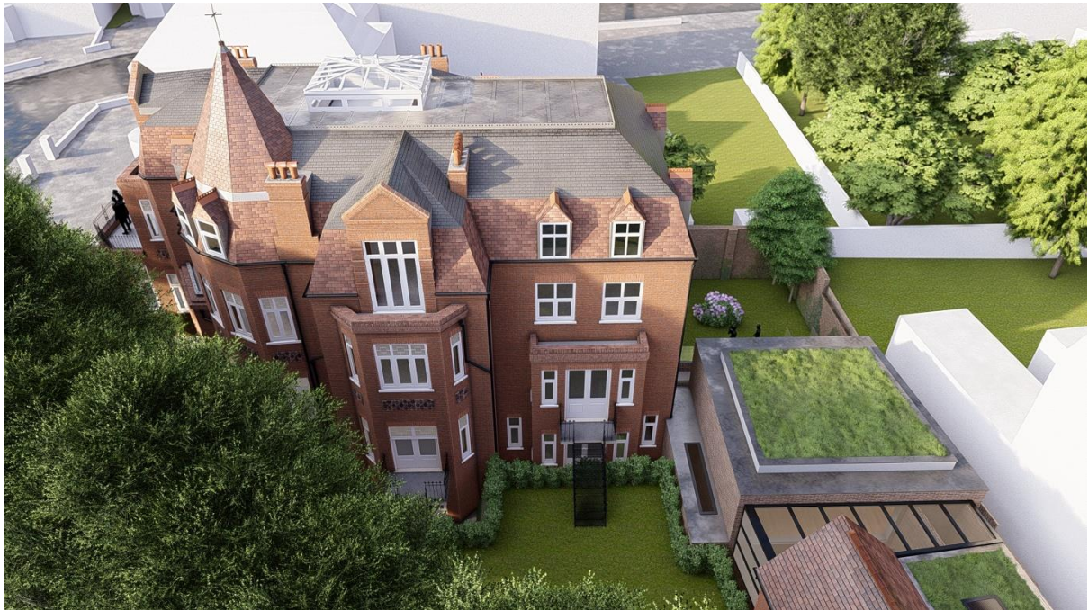
Figure 4. Proposed Southern Aspect.