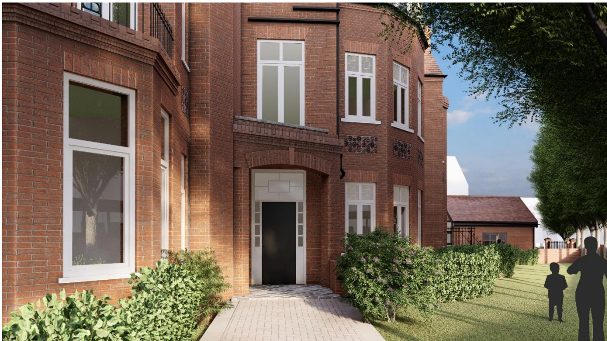
Figure 10. Proposed view of main entrance and front garden.