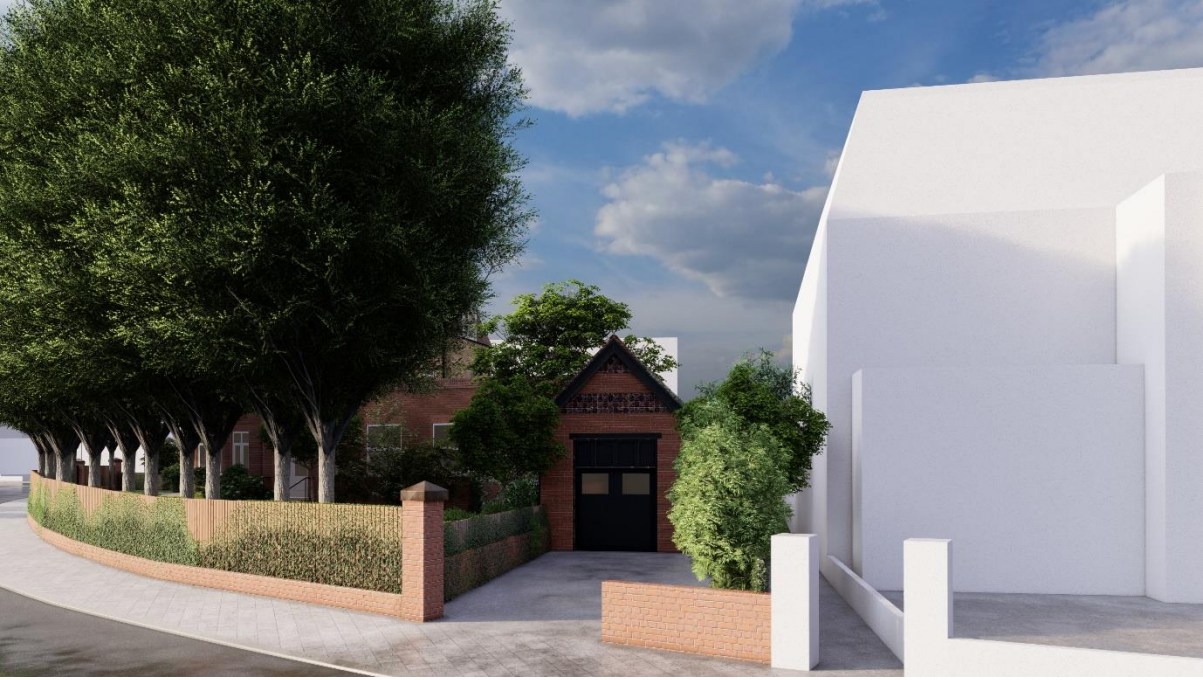
Figure 11. Existing street view from the east.