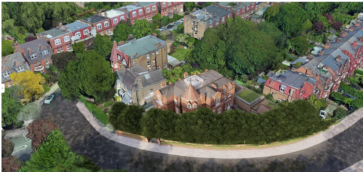
Figure 2. Proposed panoramic view.