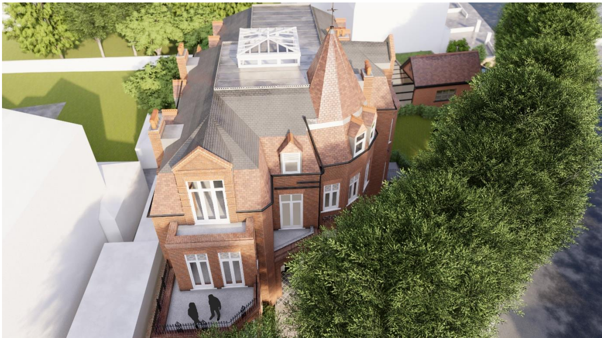
Figure 6. Proposed Western aspect.