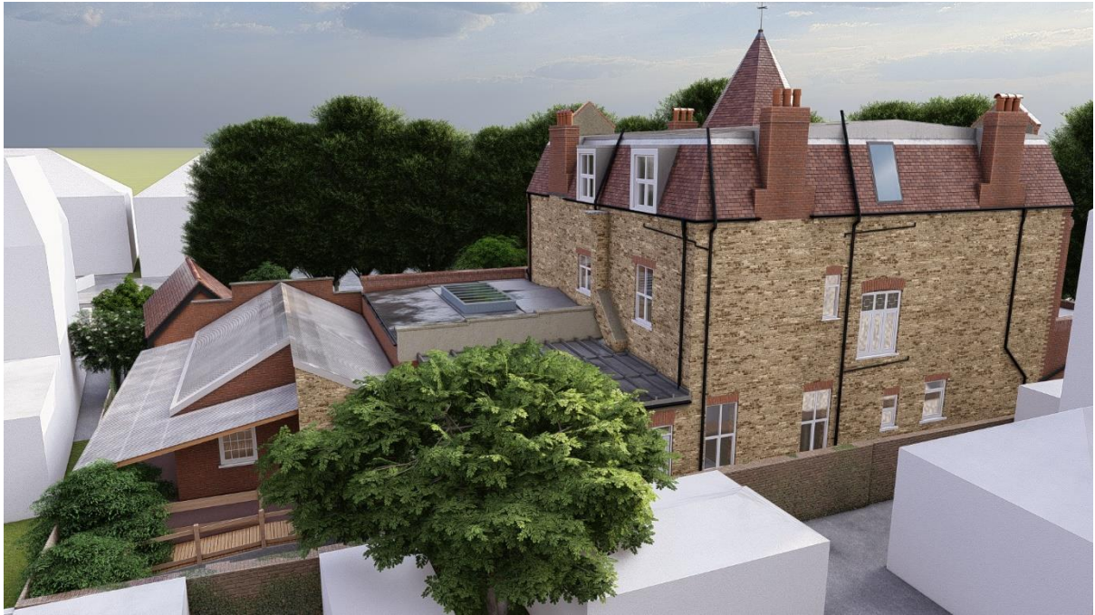
Figure 15. Existing Rear (north) view.