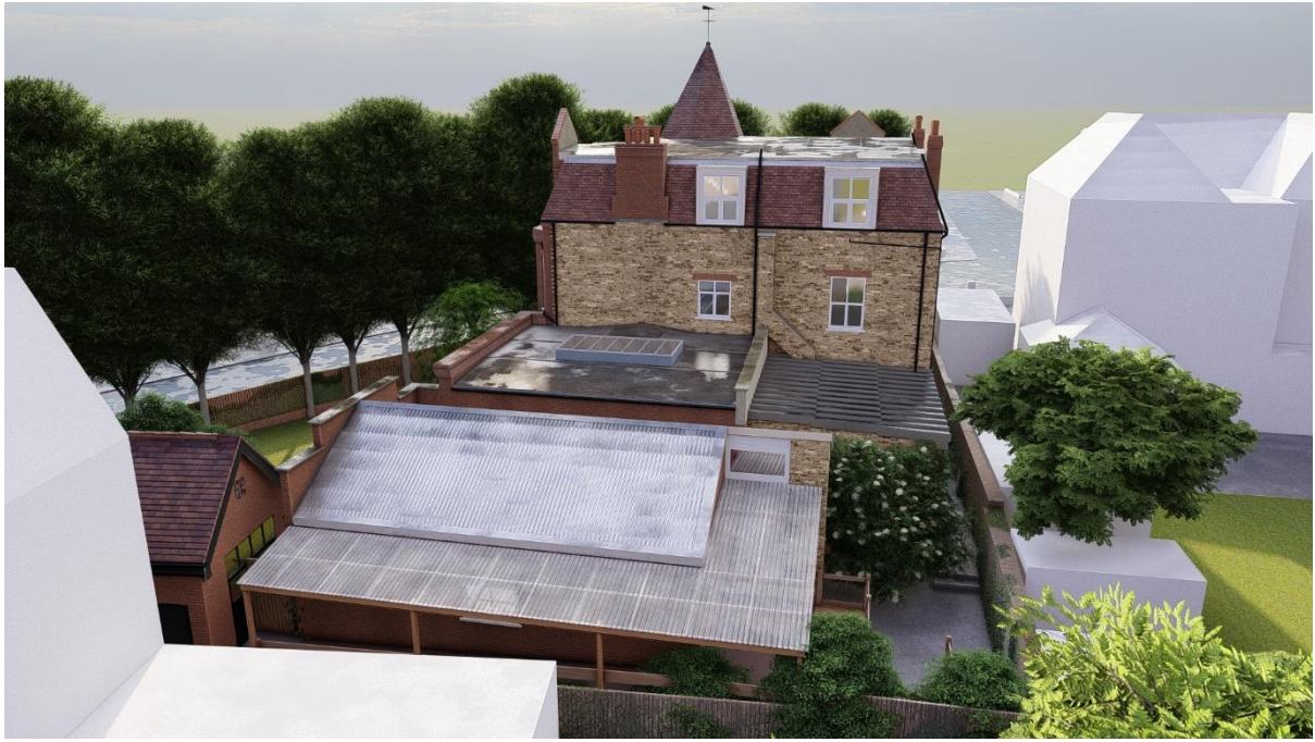
Figure 13. Existing view from the East.