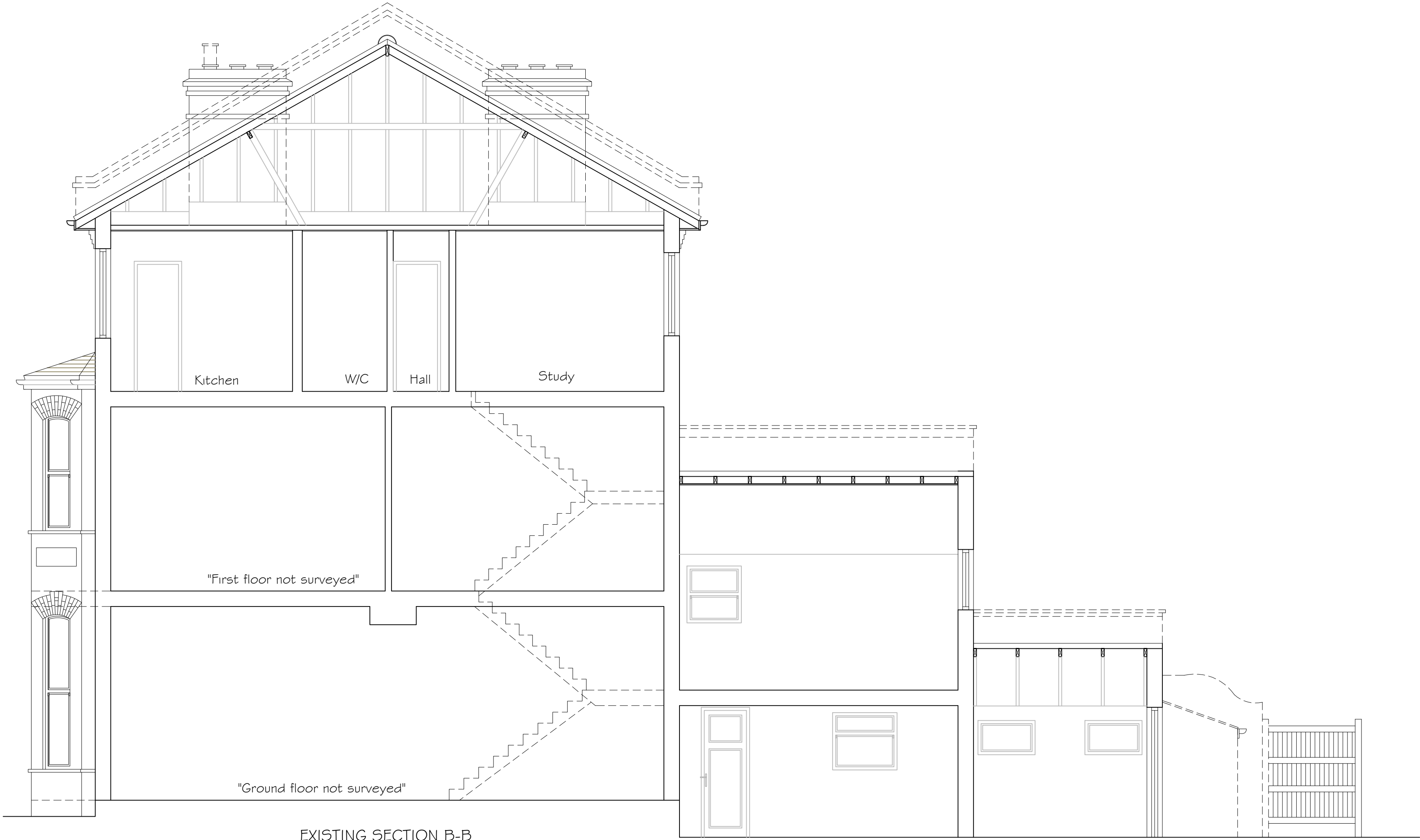
EXISTING SECTION B-B

Copyright © Absolute Lofts This drawing which is the property of Absolute Lofts is the subject of Intellectual Property Rights including copyright and design right and shall not be reproduced, copied, loaned or submitted to any other party without the written consent of Absolute Lofts. This drawing is not to be scaled. Only figured dimensions to be taken. Any discrepancies to be reported to the Absolute Lofts prior to setting out or ordering of any materials.