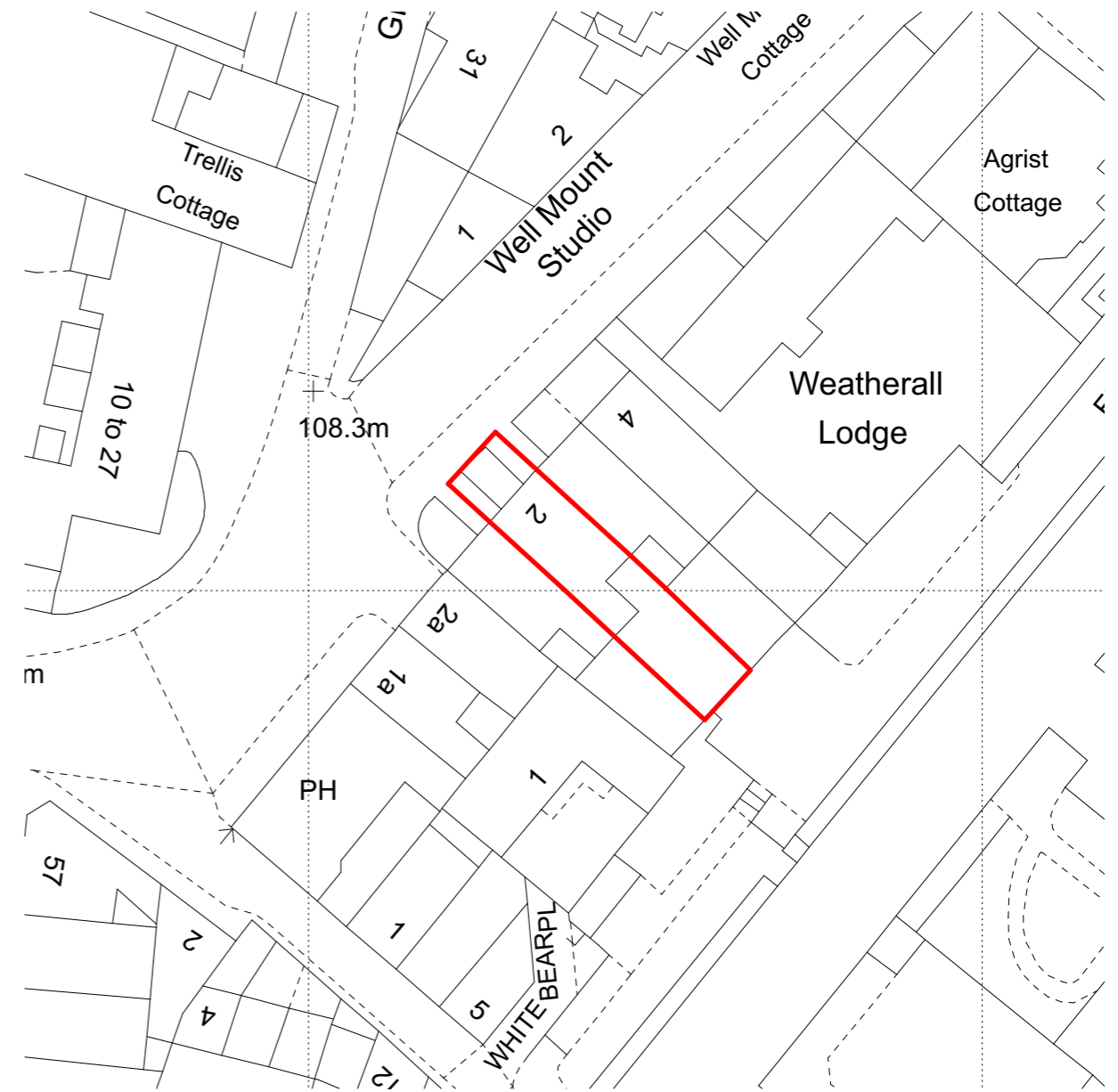
02 | Site Plan 1:500