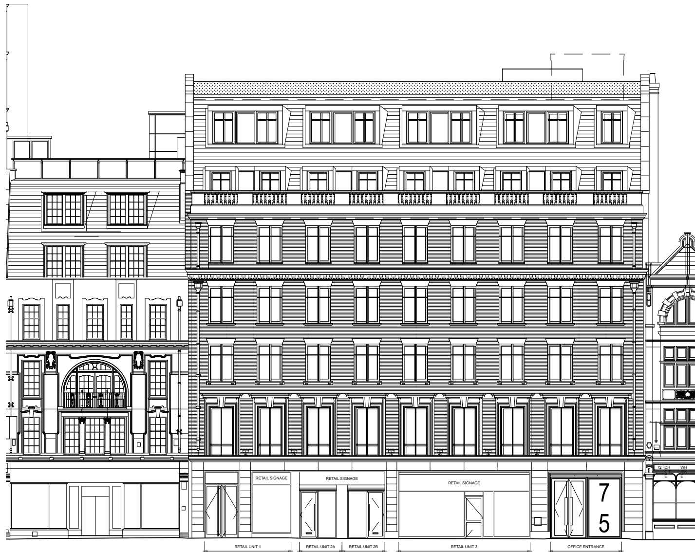
1 Proposed High Holborn Elevation 1:200