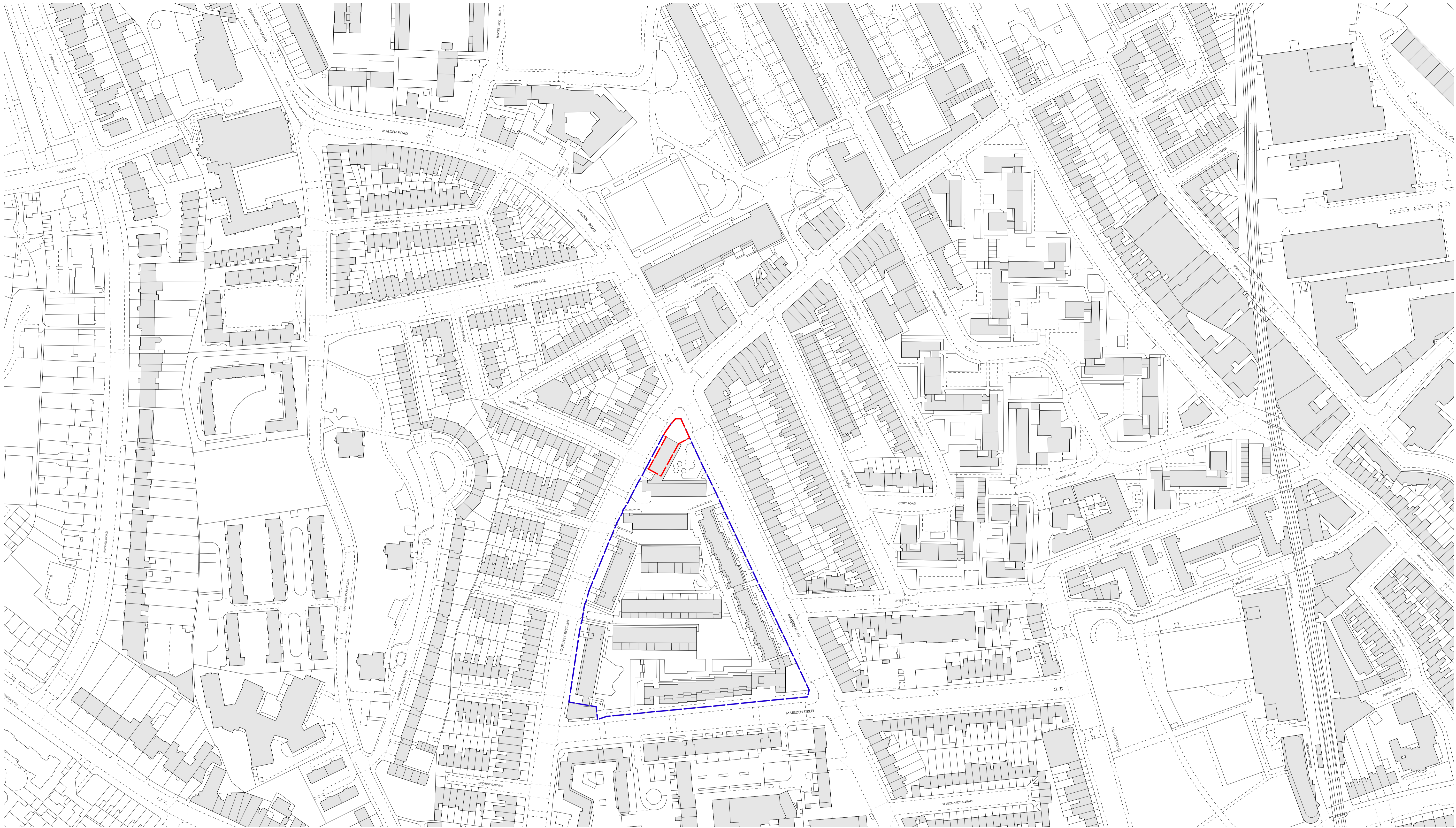
1 LOCATION PLAN 1:1250