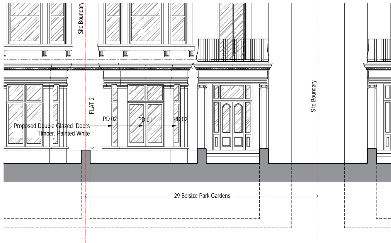
Proposed Front Elevation - Flat 2 Scale 1:100 @ A3