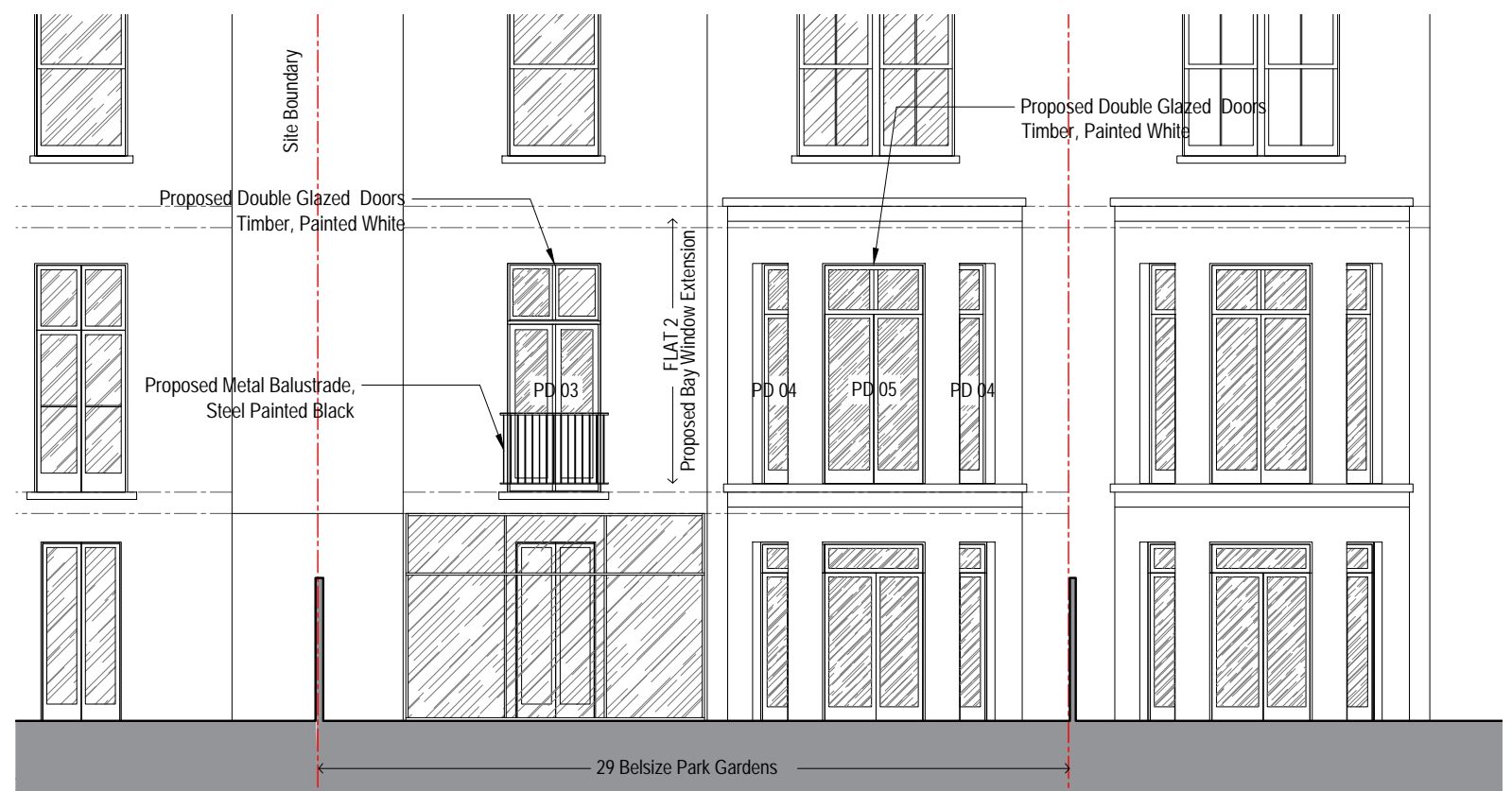
Proposed Rear Elevation - Flat 2 Scale 1:100 @ A3