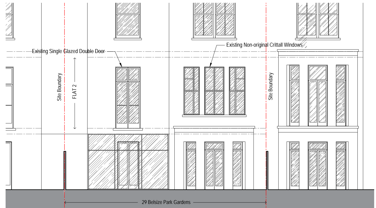
Existing Rear Elevation - Flat 2