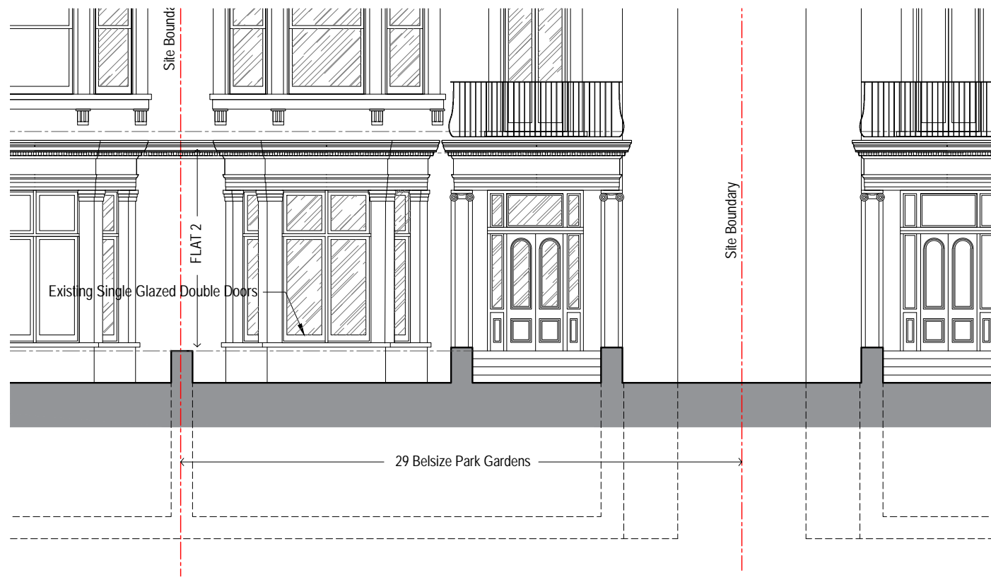
Existing Front Elevation - Flat 2