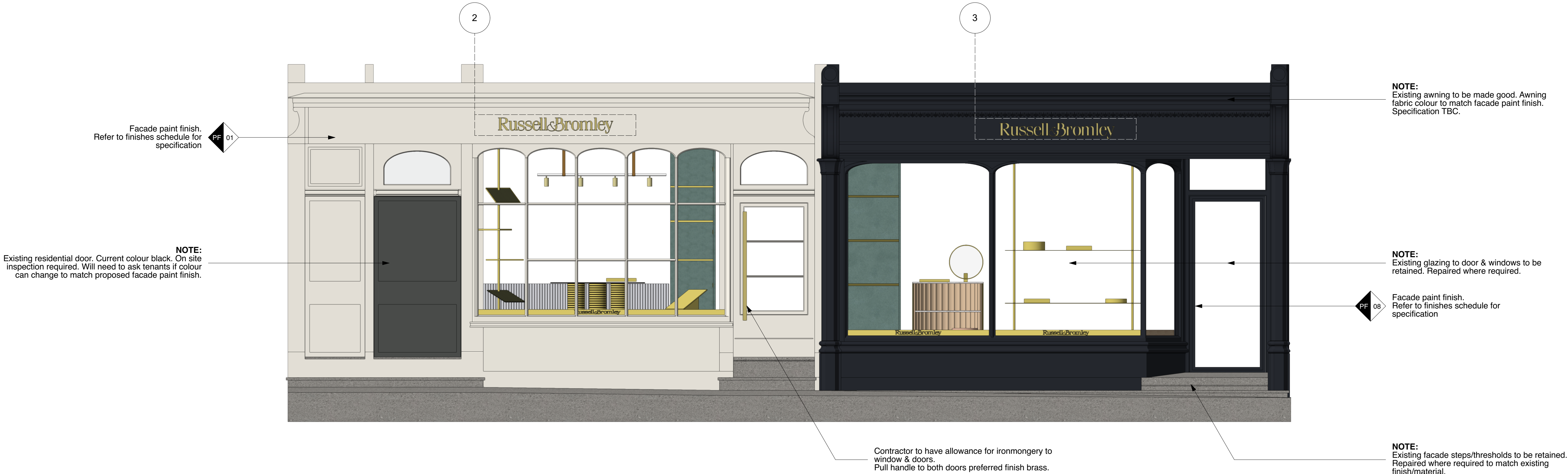
1 Proposed Facade Elevation A Scale: 1:25