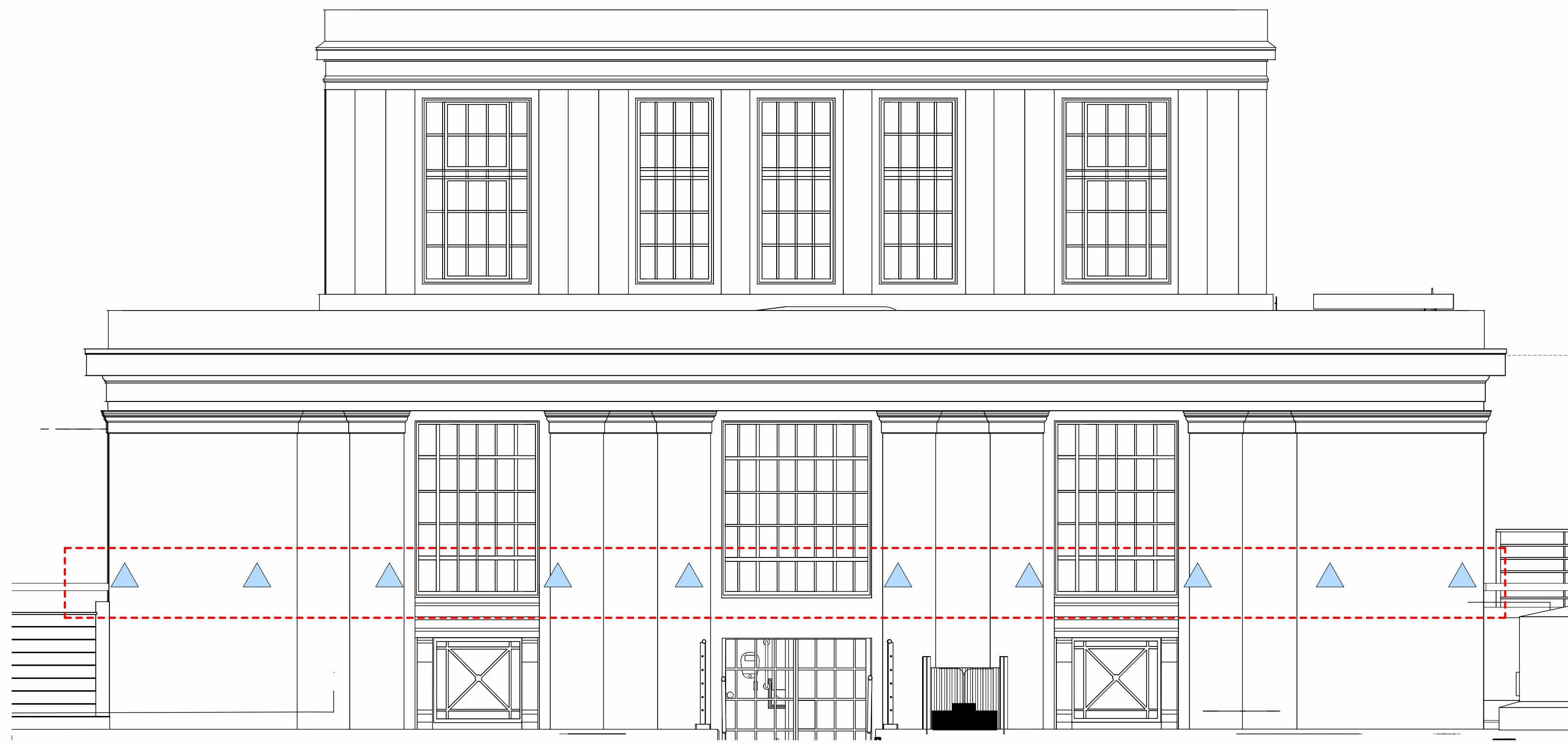
3 Elevation - Southampton Row 1:50