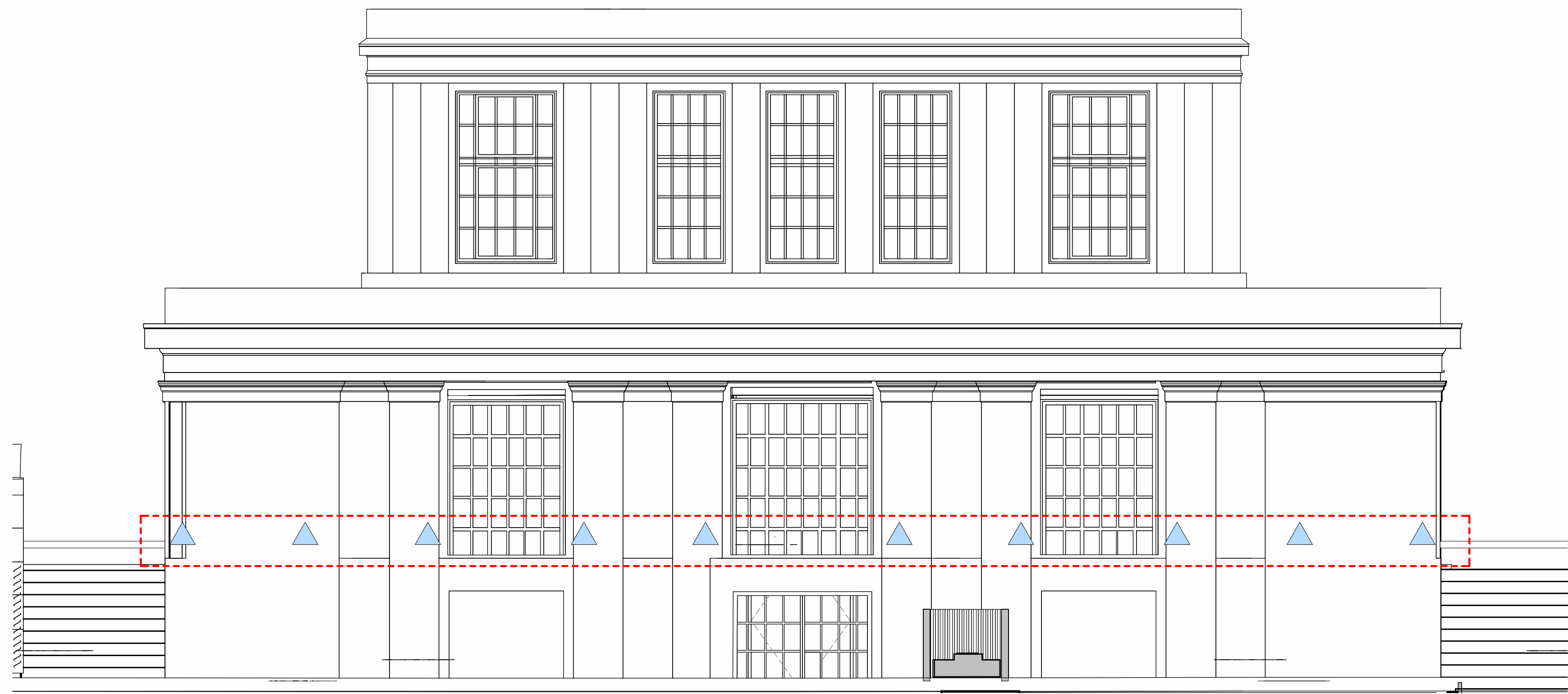
2 Elevation - Bloomsbury Square 1:50