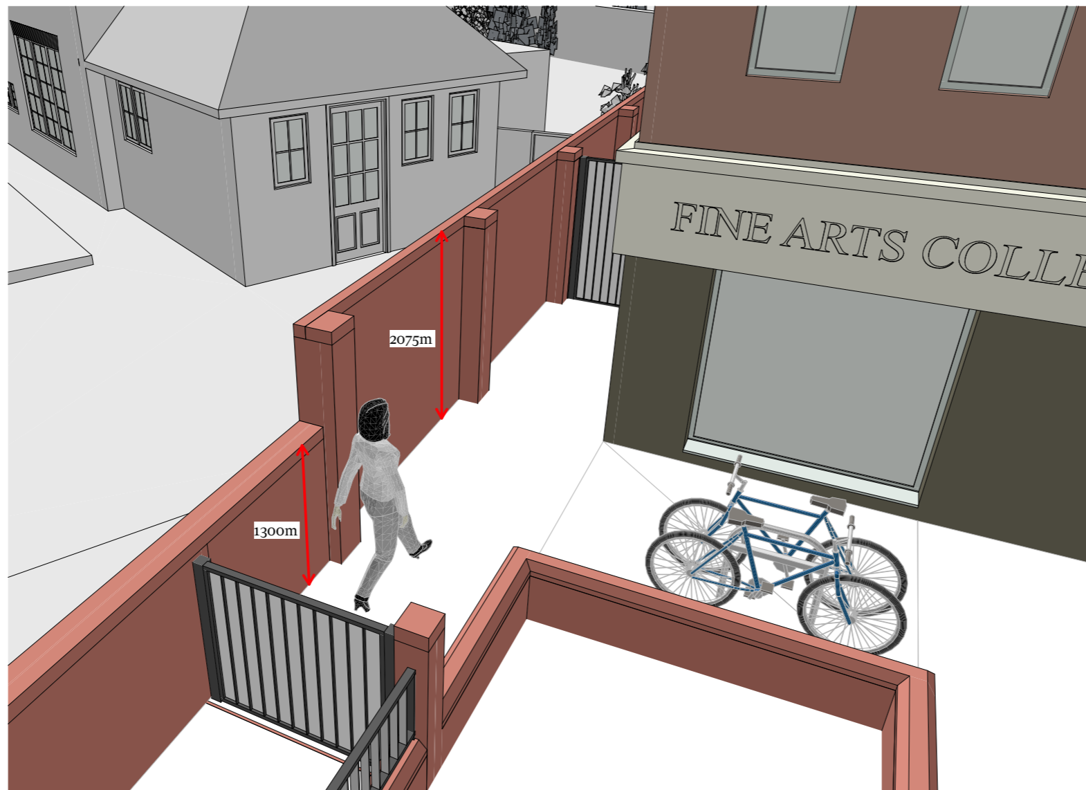
A Entrance Brick wall 3D Scale 1:200