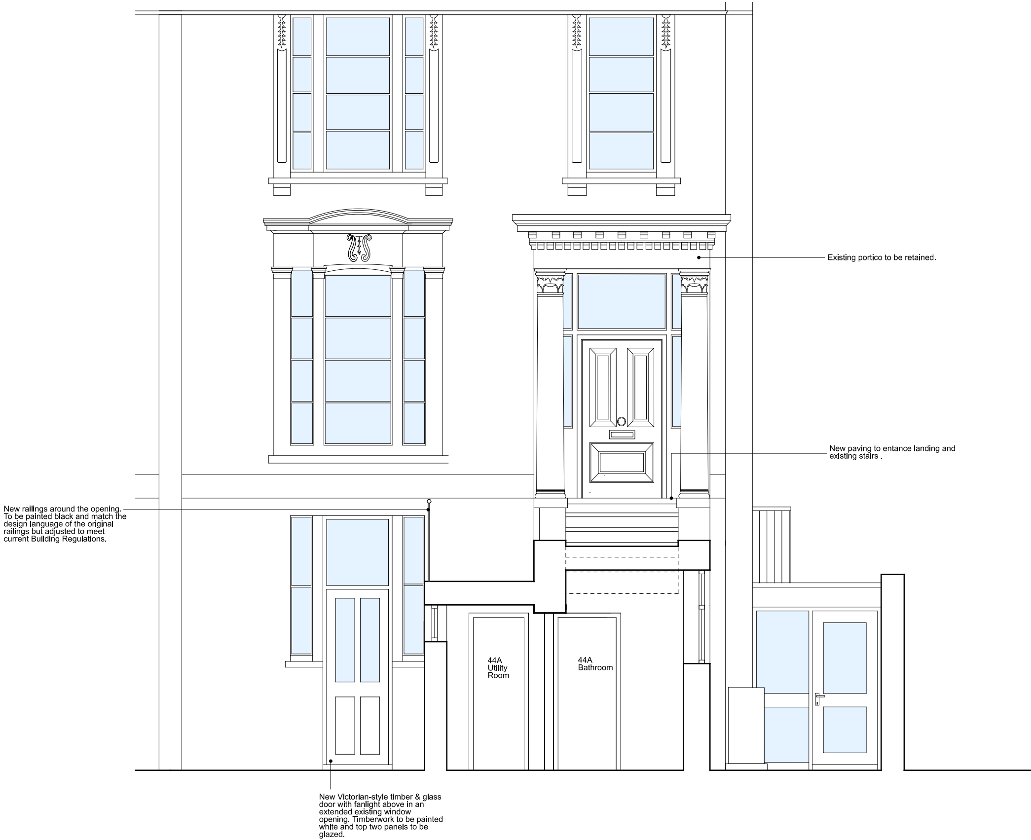
Part elevation on King Henry's Road showing proposed work to the entrance (1:50 @A3)