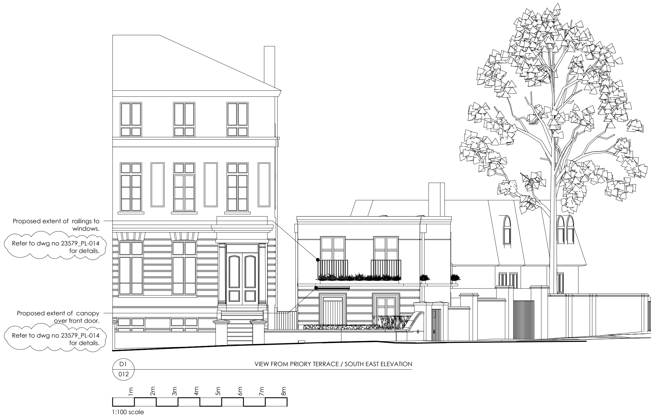
VIEW FROM PRIORY TERRACE / SOUTH EAST ELEVATION