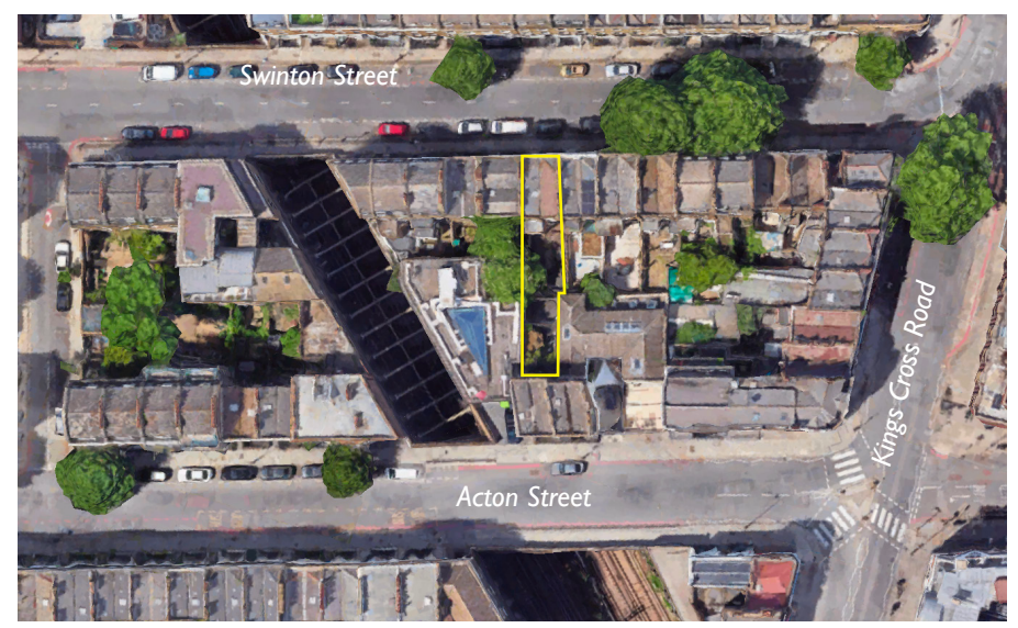
fig 1.1 Satellite view showing site outlined in yellow

No. 26a is the ground and lower ground floor garden flat of a property that was converted from a single dwelling into 4 self contained flats in 1980.