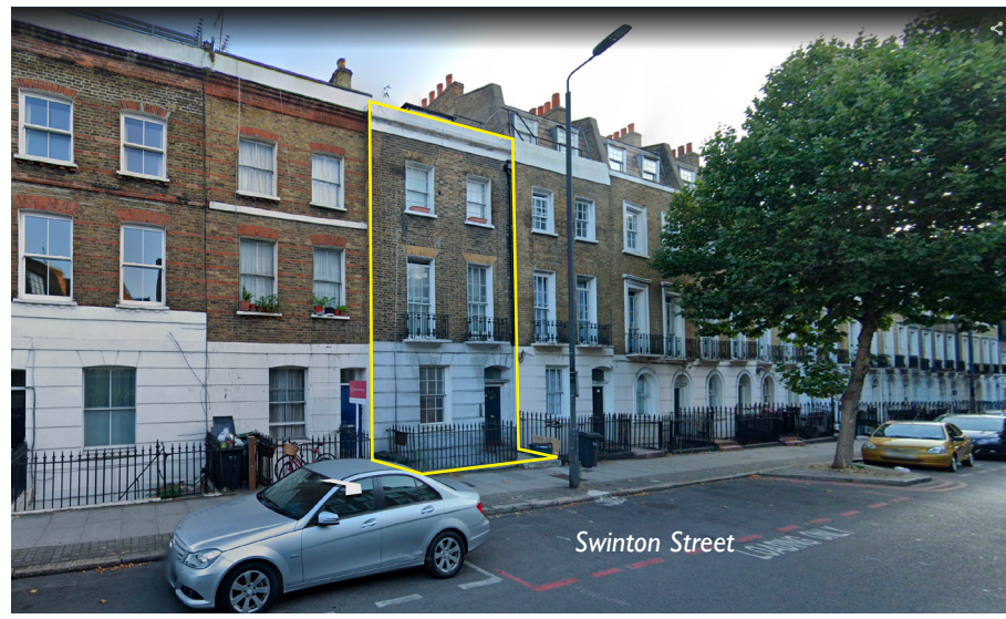
fig 1.2 Street view showing site outlined in yellow