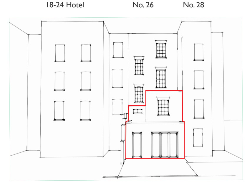
fig 3.2 Sketch - Proposed Rear Elevation