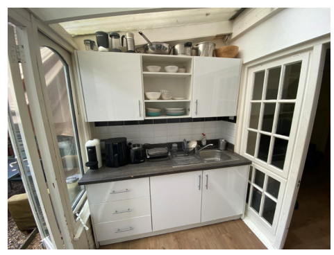
fig 4.1 Photograph - External