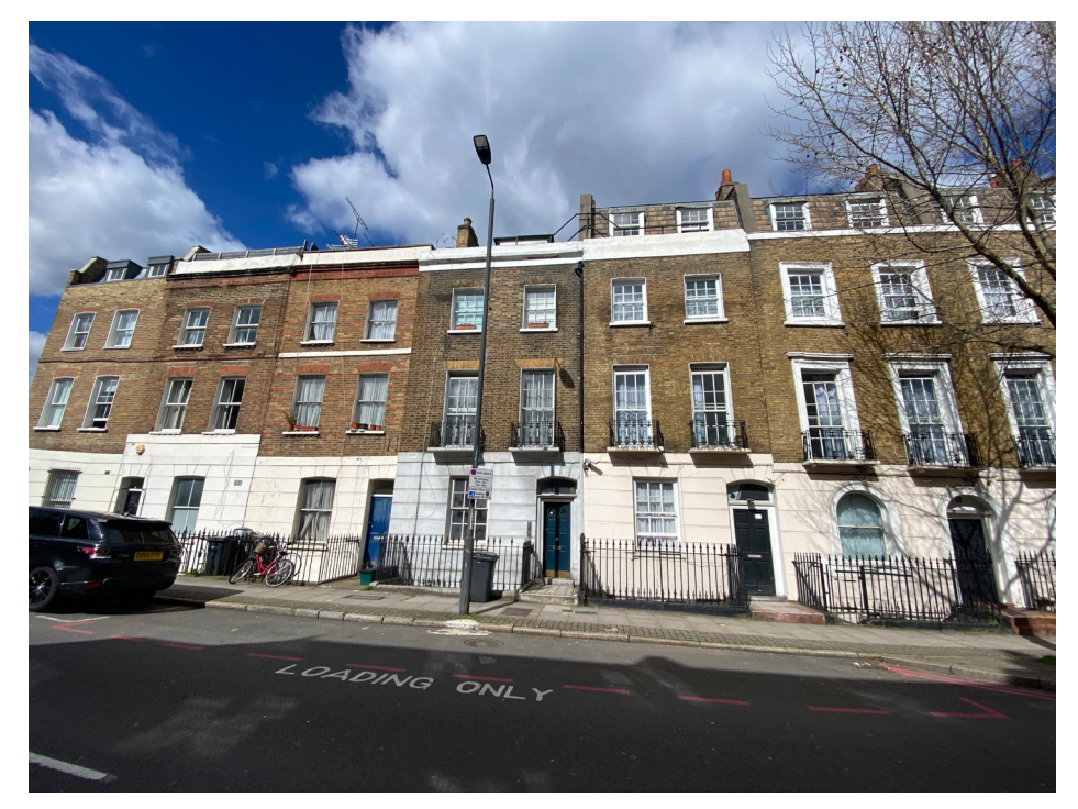
fig 3.1 Street Elevation

Terrace of 12 houses. c1835-44. 3 storeys and basements. Nos 22-26 with C20 attics in slated mansard roofs with dormers. 2 windows each. Nos 4-22: yellow stock brick with rusticated stucco ground floors and plain 1st floor sill band. No. 14, ground floor painted. Nos 10 & 12 slightly projecting. Round-arched ground floor openings. Architraved doorways with pilaster jambs carrying cornice-heads, some with patterned fanlights, and panelled doors. Architraved sashes; ground floors mostly with margin lights. 1st floors with cornices and cast-iron balconies. Parapets. Nos 24 & 26: yellow stock brick with rusticated stucco ground floors and plain 1st floor sill band. Segmental-arched doorways with fanlights, No.24 with pilaster-jambs carrying cornice-head, No.26 with fluted quarter columns. Gauged brick flat arches to recessed sashes with glazing bars; 1st floors with cast-iron balconies. Stucco cornices and blocking courses. INTERIORS not inspected. SUBSIDIARY FEATURES: attached cast-iron railings with tasselled spearhead finials to areas. (Survey of London: Vol. XXIV, King's Cross Neighbourhood, St Pancras IV: London: -1952: 98).