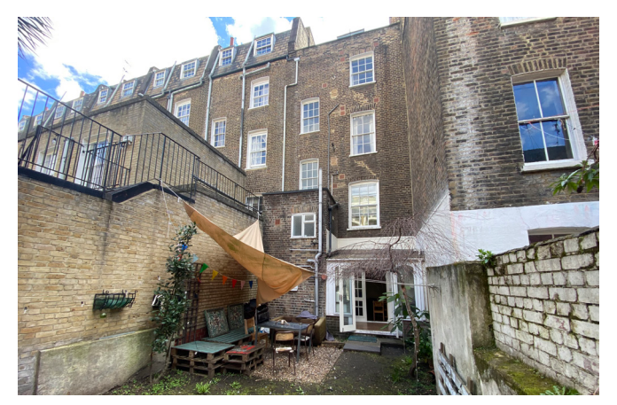
fig 3.1 Photograph - Existing Rear Elevation

This will require the modification and construction of stud walls , new electrics and plumbing and demolition works to the existing structure to remove the chimney breast and structural walls.