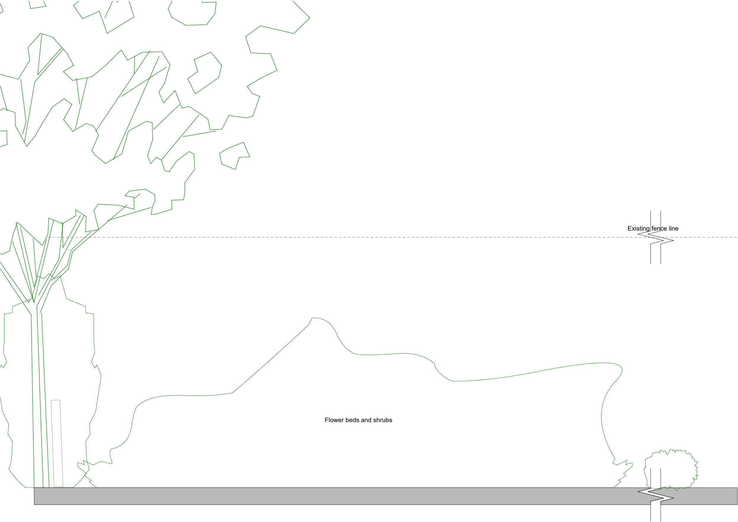
ELEVATION C 1:25@A3