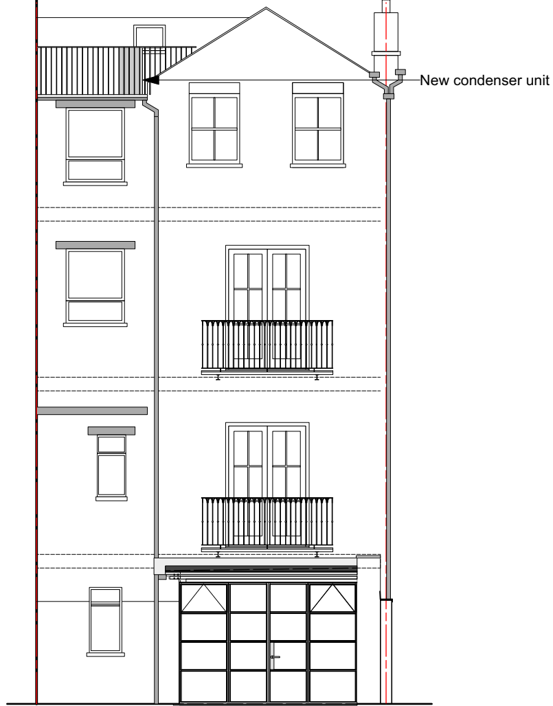
Rear Elevation as Existing 1:100 @ A3 / 1:50 @ A1