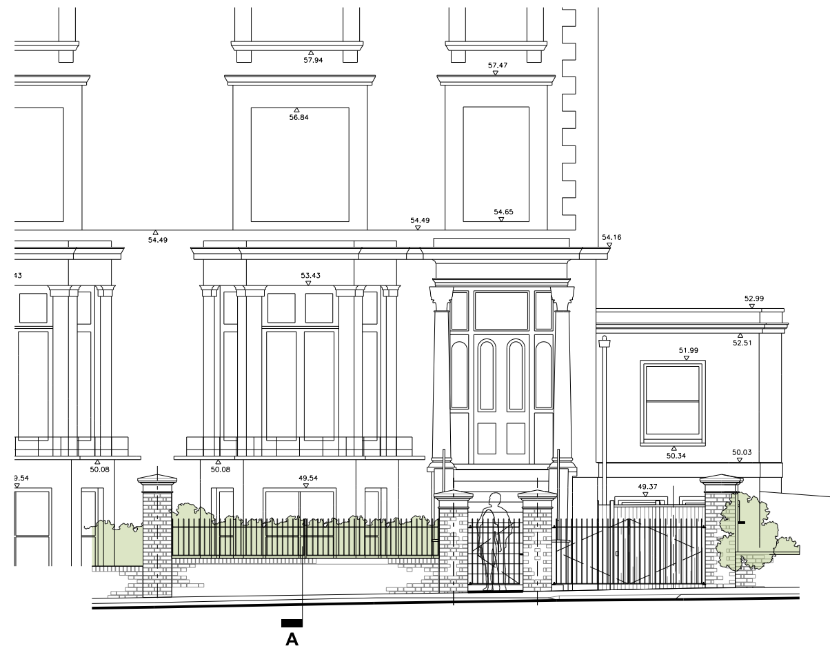
Part Principal Elevation View - Proposed 1:100 @ A3