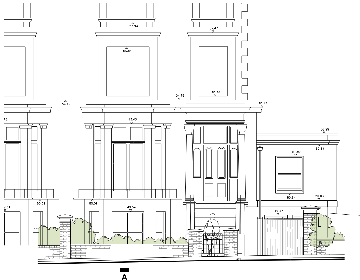
Part Principal Elevation View - Existing 1:100 @ A3