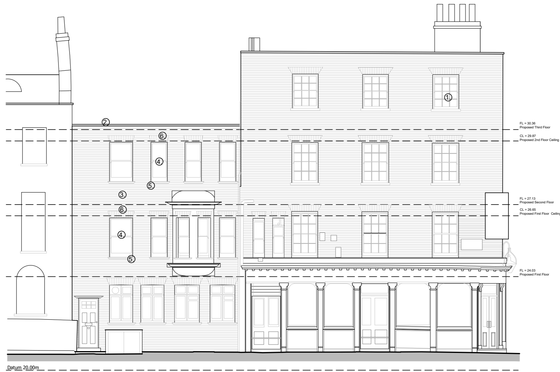
Proposed North West Elevation

GENERAL NOTES: 1. THIS DRAWING IS TO BE READ IN CONJUNCTION WITH THE OTHER RELEVANT CONSULTANTS DRAWINGS. 2. ALL FINISHES ARE TO CONFORM TO THE CURRENT BUILDING REGULATIONS. 3. REFER TO A SEPARATE DOCUMENT FOR THE DESIGNERS RISK ASSESSMENT. 4. ALL WORKS OR MATERIALS INDICATED ON THIS DRAWING ARE TO BE TO THE LATEST RELEVANT BRITISH STANDARDS AND CARRIED OUT IN ACCORDANCE WITH THE BRITISH STANDARDS CODES OF PRACTICE OR RECOGNIZED INSTITUTE OR TRADE ASSOCIATION RECOMMENDATIONS AND PUBLICATIONS.