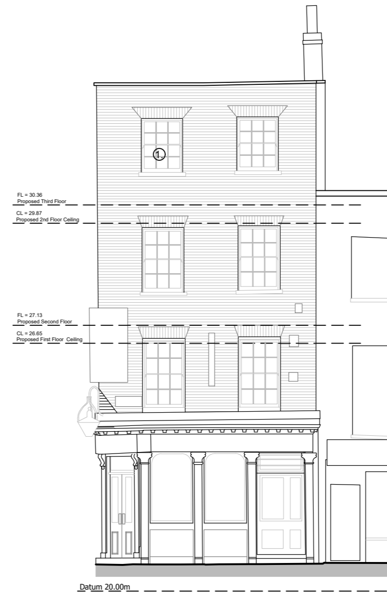
Proposed South West