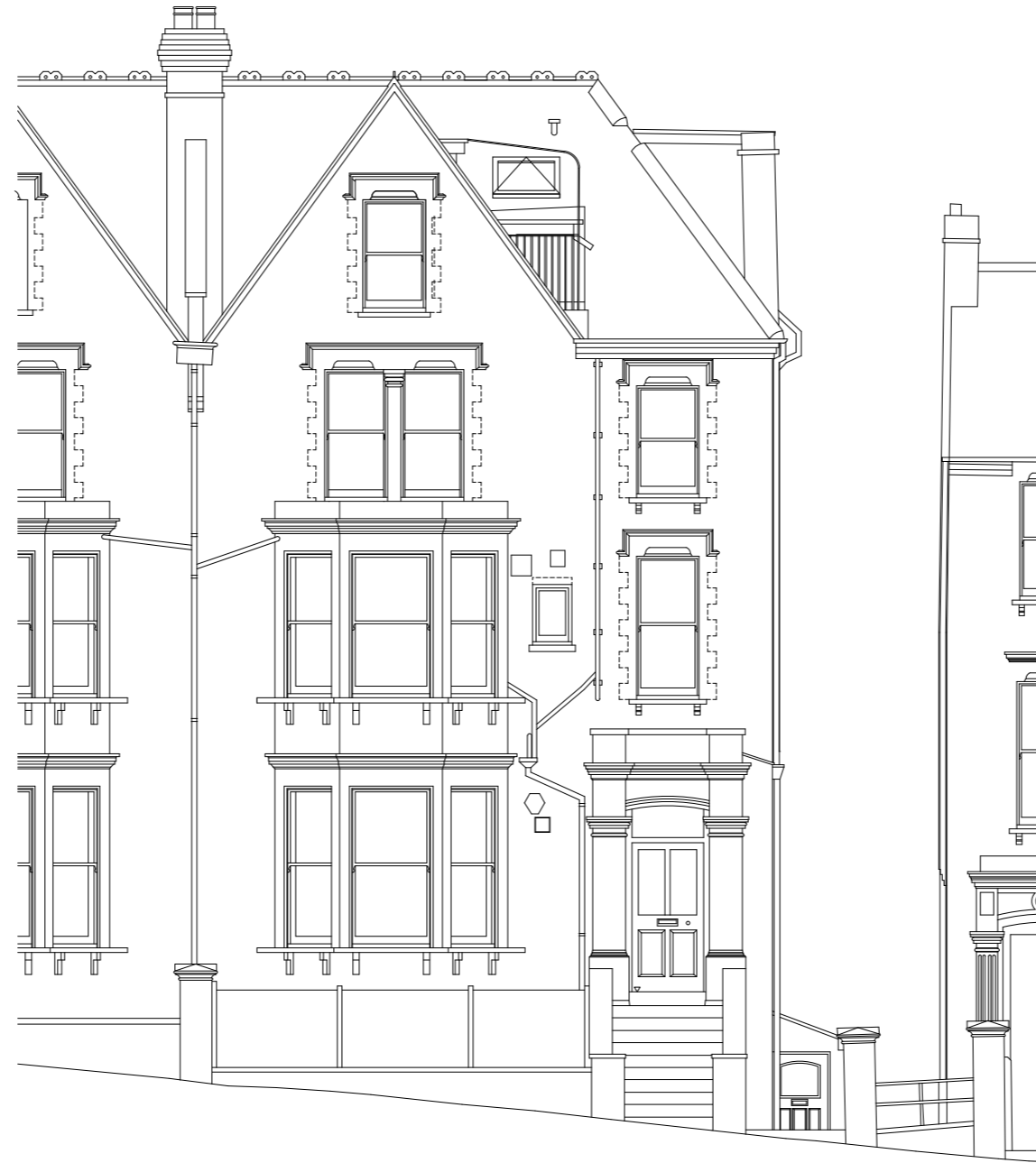
FRONT ELEVATION: AS EXISTING