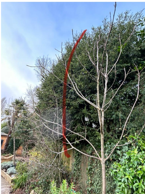
T1: Yew (6m): Reduce back overhang by 1m to prevent excessive shading on flower beds of Heathlodge