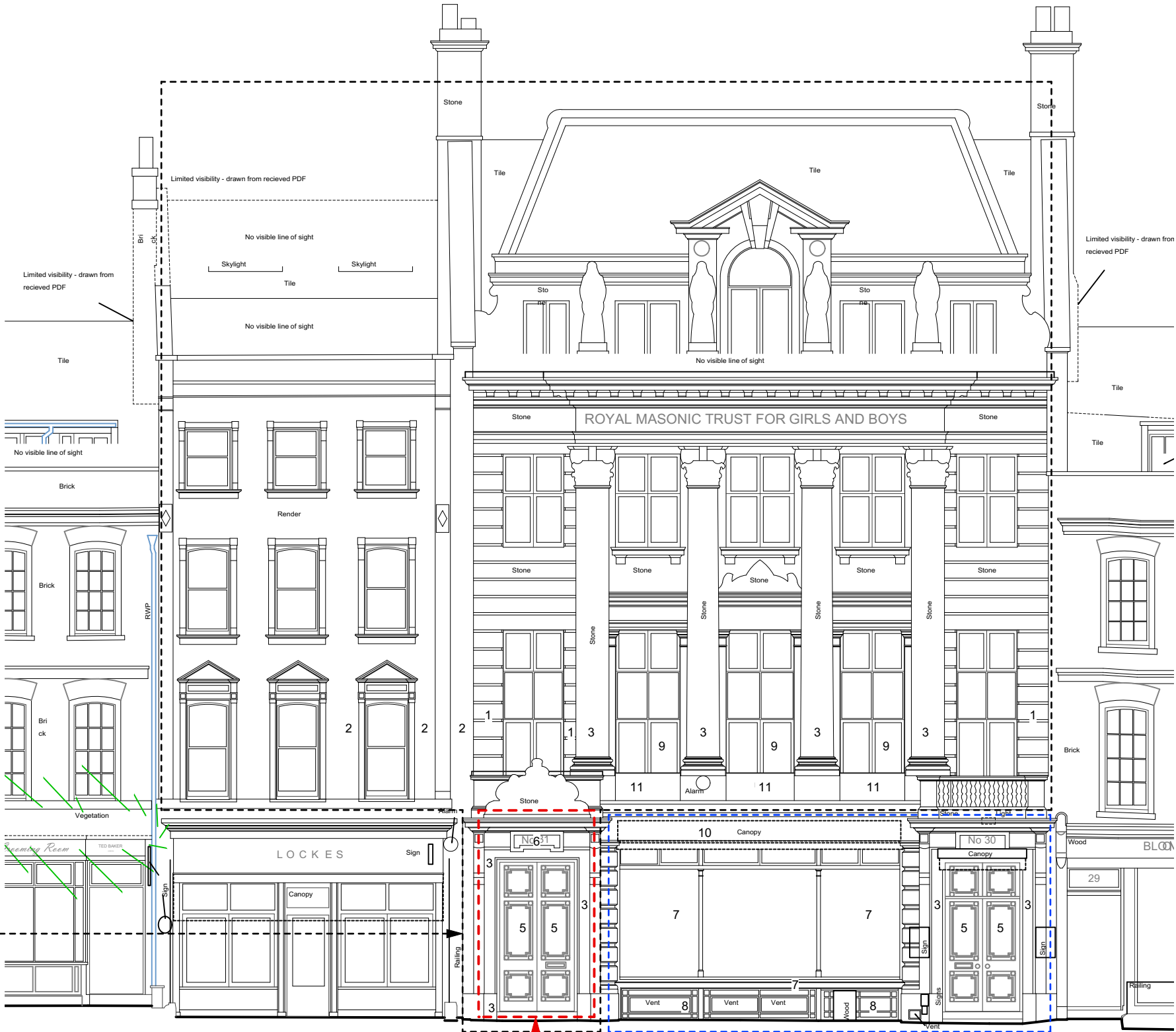
1 Existing Gt Queen Street Elevation 1:100 @ A3

Shop front and door demised to No30 Gt Queen Street not part of this application.